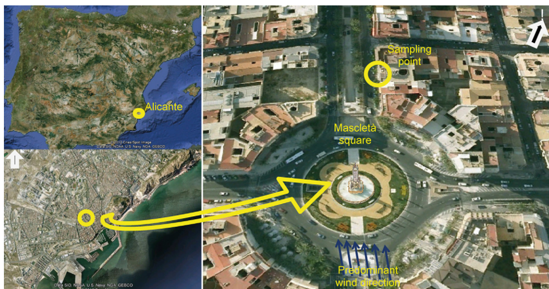
Fig. 1. Location map and picture of sampling site. White arrows indicate north direction.

papers have been published describing the hazardous impact that both long-term and short-term firework events can have on human health [12–16].