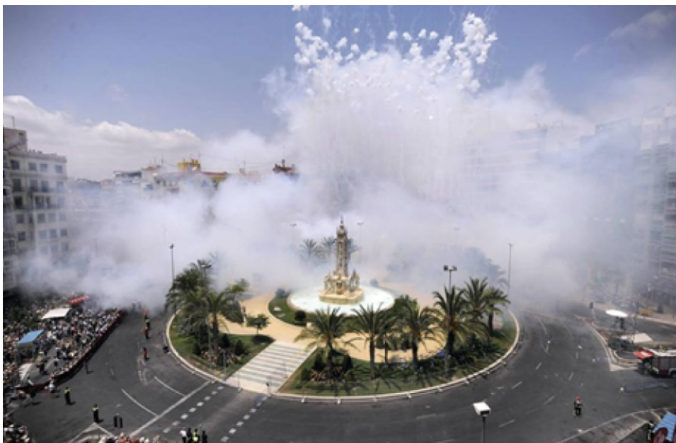
Fig. 2. White smoke cloud typically generated during Alicante Festival Masclatà.

consequence, the people (~20,000) concentrated (50 m faraway) in the streets around masclatà square and on numerous overlooking balconies from the surrounding apartments blocks were engulfed by dense white aerosol clouds and gasses produced throughout the event (Fig. 2). Despite the daily afternoon Mediterranean Sea breezes that favour contaminants dispersion, very intense short pollution spikes were expected. These pollution spikes are of special concern to individuals in attendance since massive increases of suspended particles (up to 1500 \mu\text{g}/\text{m}^3 1-h \text{PM}_{2.5} ) have been reported in an urban environmental exposure study during a fire-work episode [19].