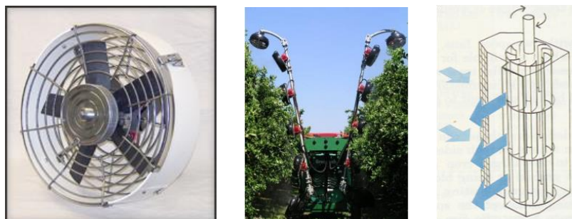
Fig. 2 a,b,c: Proptec, Sardi and Tangential (cross flow) fans.

Where finally defined rules for each devices to better fit optimum spray features on each vertical bands of the canopy.