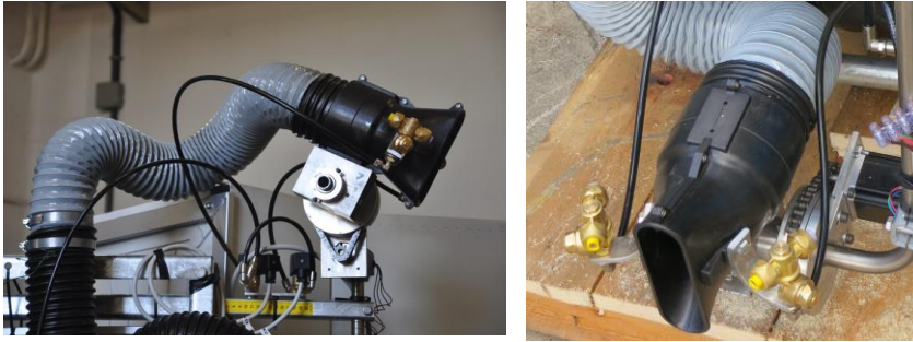
Fig. 6 – tilt diffusor ( left ) with double nozzles ( right ).

Particular interest is placed on airjet vector characterization and its effect on the canopy by means of the butterfly valve control on each single side band.