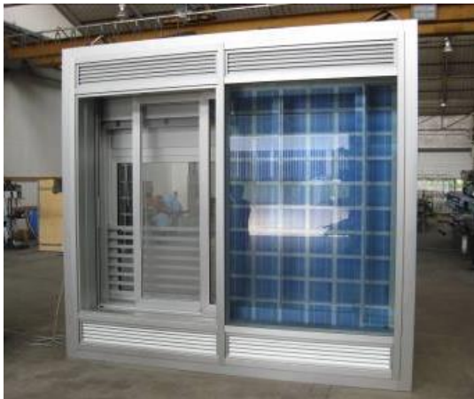
Figure 1: Smart Facade. Prototype with PV panel

The shading device made with mobile and metallic lamellae or with terracotta tiles, allows regulating the light and minimizing the glare phenomena.