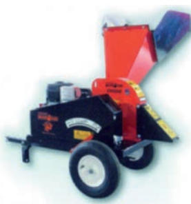
Figure 15. Bear Cat – Chipper 4.5”.