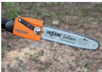
Figure 13. Pellenc – Selion – Electric chainsaw.

An innovation in the field of weed control is represented by the