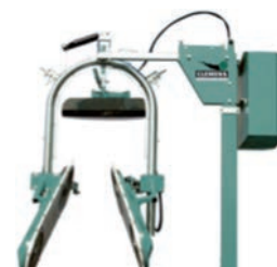
Figure 10. Clemens – Shoot binder tandem - The shoots are tied in synchronization with the driving speed. With good soil conditions, working speeds up to 7 km/h are possible. With three-dimensional adjustments, the shoot binder can be adapted to suit various types of vines and conditions in the vineyard.