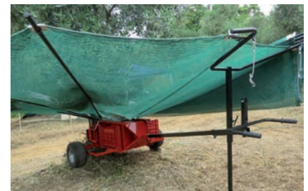
Figure 21. Bosco.-Olivspeed. The manual umbrella is a revolutionary solution for the recovery of the olives and it is available with a diameter of 4, 5 and 6 meters.