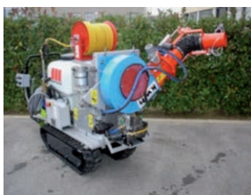
Figure 16. Martignani - Phantom B 748 “Minor-Trekker” - Nebulizer cannon.