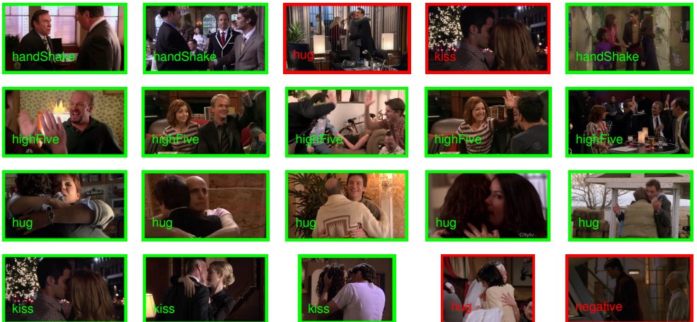
Figure 3: Top five ranked videos (leftmost is higher ranked) by our method for each action (handShake, highFive, hug and kiss) of the HighFive dataset.