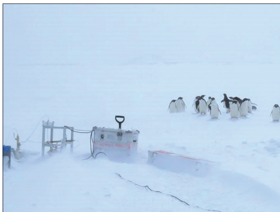
Figure 1: Targeted Antarctic field investigation of chemical redistribution in the coastal seasonal sea-ice zone during spring sea-ice melt