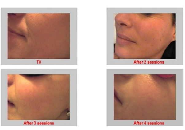
Fig 4: MW Laser PBM

The median test for independent samples showed that all the differences between groups are equally statistically significant at each follow-up (p=0.000).