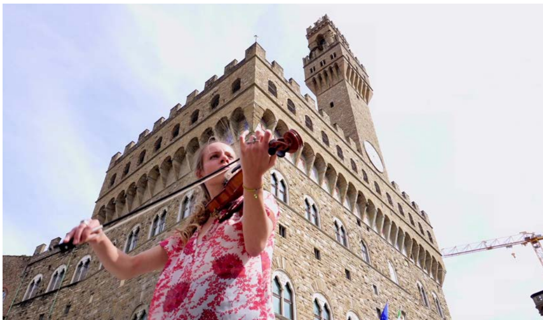
Fig. 7 The Violinist plays a melody inspired to Belgian traditional music, Piazza della Signoria.

As masterfully expressed by Paul Valéry (1923) through the dialogue between Socrates and Phaedrus in Eupalinos ou l'architecte - L'Âme et la Danse - Dialogue de l'Arbre , music and architecture make us think of anything but them, and the urban space in the performance becomes the place of the relationship between music and architecture, beyond words and in the absence of words. In this perspective, art can be understood as a system of formal relations rather than a symbolic representation of reality (Kubler, 1976/2002; Focillon, 1943/1987; Langer, 1950/2017). Therefore, from the top of Piazzale Michelangelo, in front of the church of S. Miniato al Monte, the narrator is the only one who makes words resonate to guide the audience beyond the images towards other places, evoking perilous journeys of men in search of freedom (Figure 6).