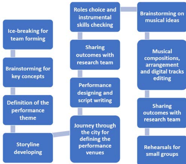
Fig. 1 Outline of the creative process 4 . Graphic elaboration by the author.

The methodology applied within the CommUnity Project was qualitative, with feedbacks being gathered from all those involved through interviews and reports related to the artistic activities. The research activities were developed according to a laboratory approach through a series of online meetings, carried out during the period 2020-2021. In addition, the ABR (Art-Based Research) methodology and the 'design thinking' –as pathway for solving critical and wicked problems in professional and educational contexts