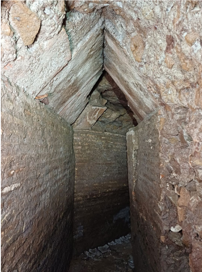
Fig. 1. Lateran Baptistery: sewer of the third- and fourth-century thermal complex showing signs of subsidence and repair.

Our long-standing work at the Lateran Baptistery (S. Giovanni in Fonte) continued with further analysis of the hydraulic system by Thea Ravasi and Elettra Santucci, combined with an inspection of historic fabric in the baptistery's roof. The structural assessment and recording of the sewers of the baths were finally made possible due to the lack of water, which rendered them accessible. This work provided additional information that confirmed our hypothesis: many of the structural interventions in the bath complex during the third and fourth centuries AD were responses to stability and subsidence issues the building had faced throughout its entire history (Fig. 1). These assessments also enabled the team to explore and document structures that had not been seen since Magi's 1962–4 open-air excavations around the baptistery. In particular, the team focused on analysing a portion of the foundations of the octagonal building that had traditionally been inaccessible to scholars. This analysis confirmed our hypothesis that the construction of the foundations of the octagonal building is more complex than previously understood and provided useful insights relevant for