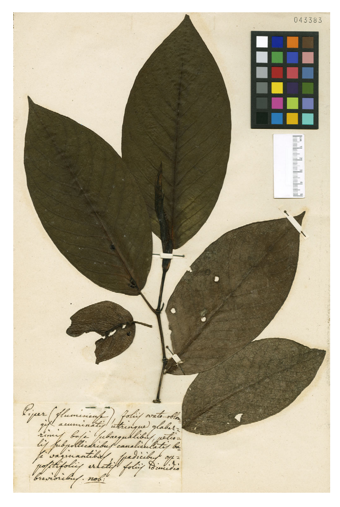
Fig. 1. Lectotype of Piper fluminense Raddi at PI (sheet no. 1, Acc. No. 043383). The label is handwritten by Raddi.

The illegitimate later homonym Piper fluminense C.DC. is a synonym of Manekia obtusa (Miq.) T.Arias & al. (Arias & al., 2006).