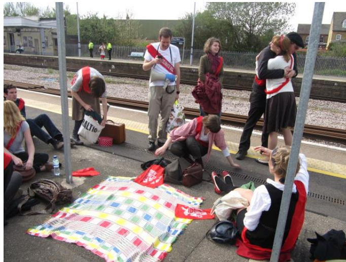
Image 5 – Setup of picnic at Canterbury Station, marking end of the Unfair Fare Dodge.

Not only were the DFEs used to frame the events in particular and novel ways, but they can also be seen to play a role in promoting the more typical features of contentious politics such as WUNC displays. Each of the displays (worthiness, unity, numbers, commitment) were exhibited during the course of the events and through the DFEs.