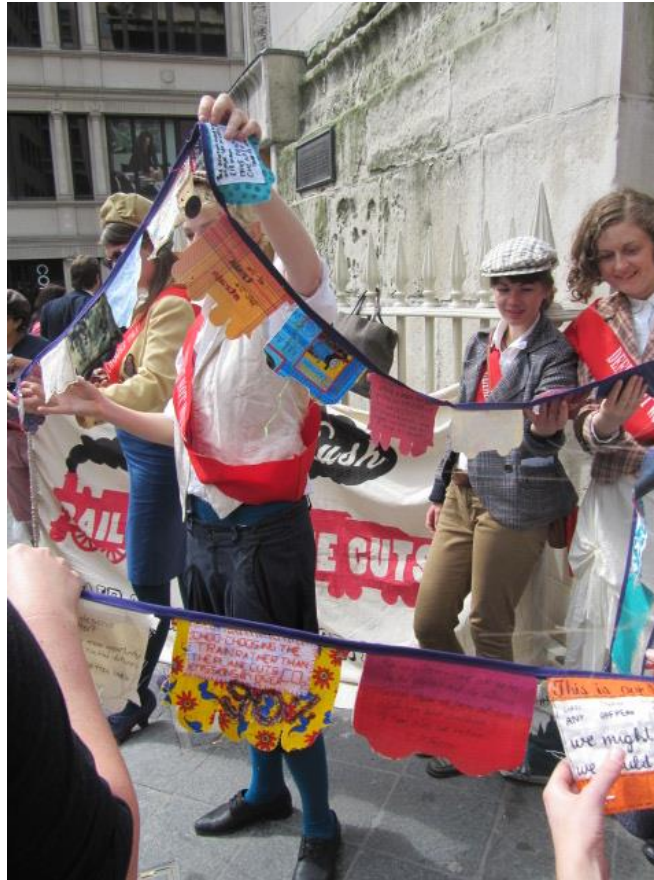
Image 3 – Petition-train formed from individual stitched passenger cars

After the rally, participants marched to a nearby train station. Here the plan was to use pre-paid ‘Oyster’ cards which would allow the protesters to get on the train to Canterbury without paying the normal fare of over £25. The protesters believed that this was legal as long as they did not leave the train station in Canterbury but returned to the station at which they originally boarded. They accepted to pay a penalty of just over £7 upon returning to the original station, arguing that £7 was the equivalent fare for a journey of the same length in many countries in continental Europe. Waiting for the next train to arrive,