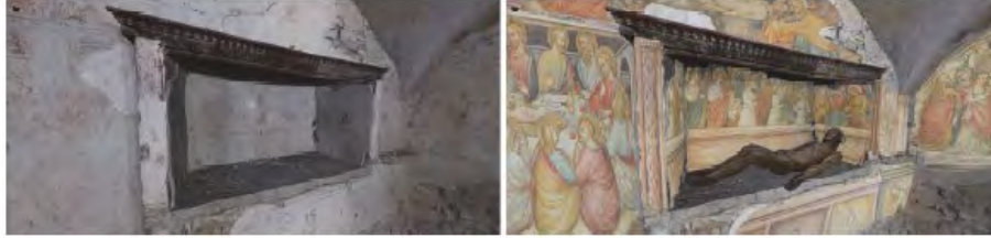
Fig. 1. The present state of the “Tomb of Christ” and its virtual reconstruction.

The whole reconstruction is available in the form of a virtual tour based on full panoramic images; a solution based on HTML language that allows a complete structure of the pages that remain independent from any proprietary software based on expensive subscriptions. The virtual tour is enriched by the possibility of passing continuously from the present state of the church to its virtual reconstruction with the insertion of virtual interactive models available for being inspected, like the statue of Christ and the schematic sequence of the evolution of the church.