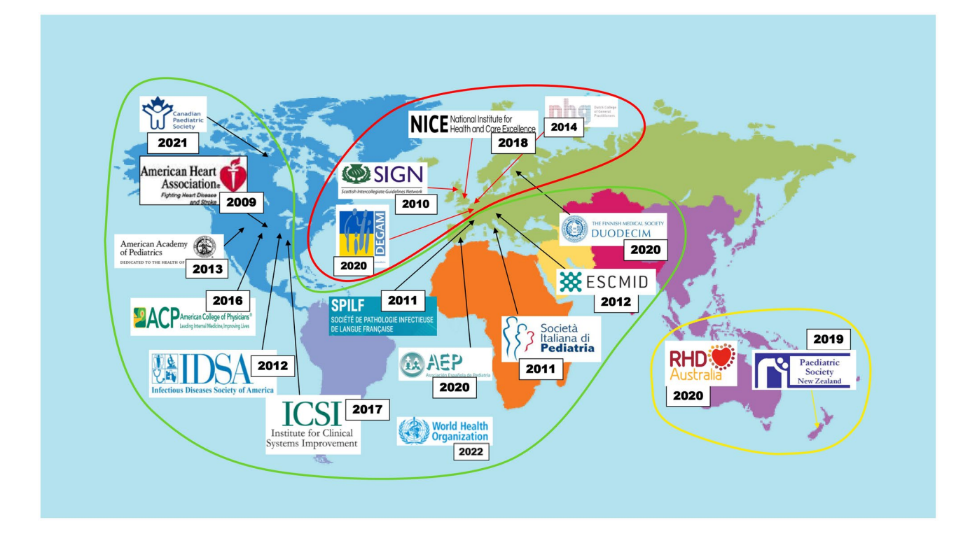
Fig. 1 Geographical distribution of analyzed guidelines

and most European countries, recommends the etiologic diagnosis of pharyngitis to correctly identify and treat GABHS pharyngitis in order to prevent acute rheumatic fever (ARF) and its cardiac complications [9, 10, 29, 32, 33, 35, 38, 41–45].