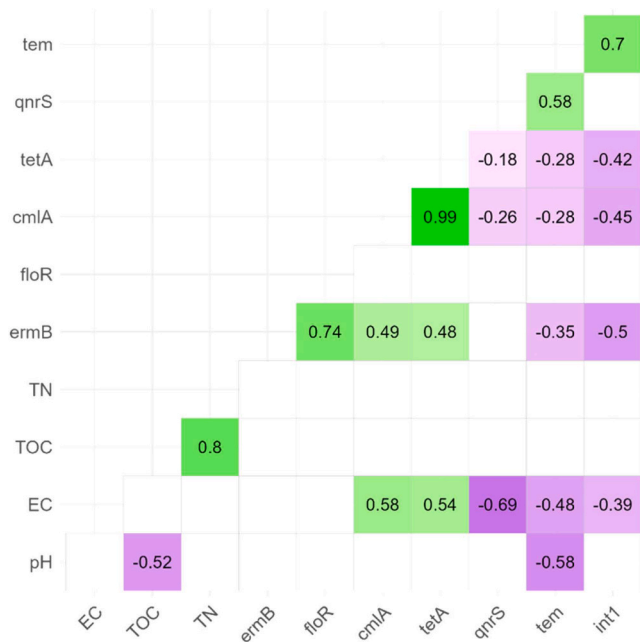
Fig. 2. Correlation matrix of ARG counts, integron counts, and selected physical or chemical variables. All variables were normalised on sample dry matter content. Data was subset considering only unprocessed manure samples. Statistically significant ( p < 0.05 ) correlation coefficients (Pearson's) are indicated only.