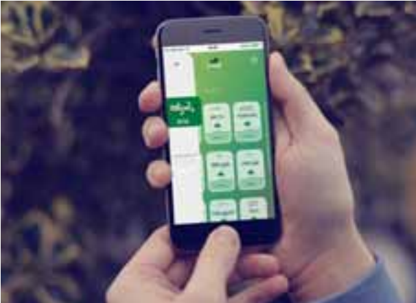
Fig. 10 | Platform interface project, SMAG project.