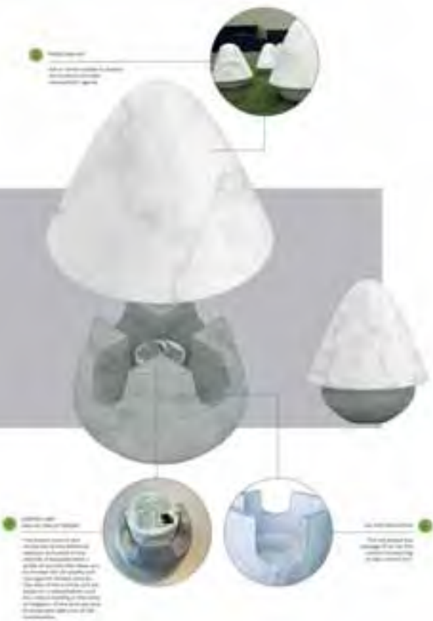
Fig. 2-4 | 'I Sette Nani' project by UpGroup, SMAG project.