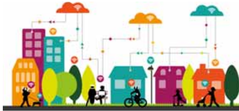
Fig. 1 | Smart System.

people for the conception of services aimed at the development of an ecosystem (including production) of the future, oriented toward social, as well as environmental and economic, sustainability (Formia, Ginocchini and Ascari, 2021; Fig. 1).