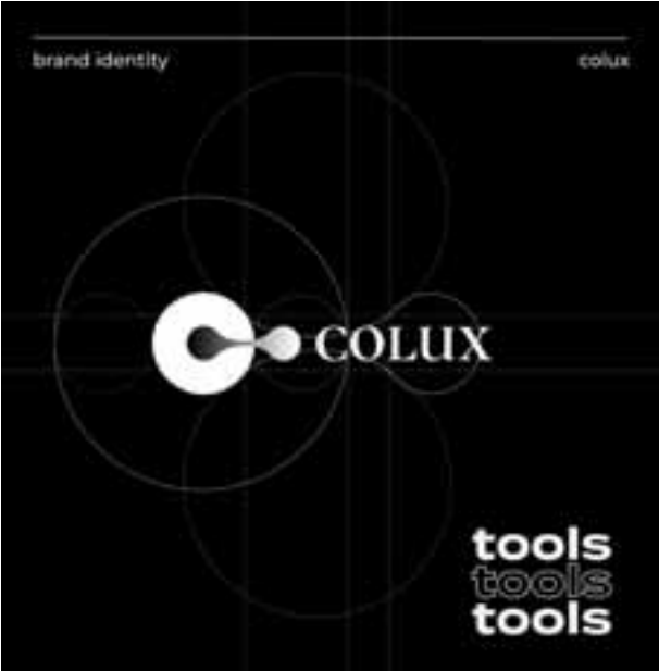
Fig. 11 | Constructive brand, COLUX project.

COLUX: a sustainable collaborative platform | Today, more than ever, companies are facing increasingly complex challenges arising from growing contemporary criticalities (Polifroni, 2021). Currently, in fact, as a result of the health emergency, traditional manufacturing companies base their competitiveness not only on the quality level of production – which by its nature characterizes them – but also on the ability to add further value to the product through the ability to respond immediately and ductily to increasingly demanding and customizable market demands. In this perspective, the digital evolution we are witnessing can contribute to a territorial development aimed