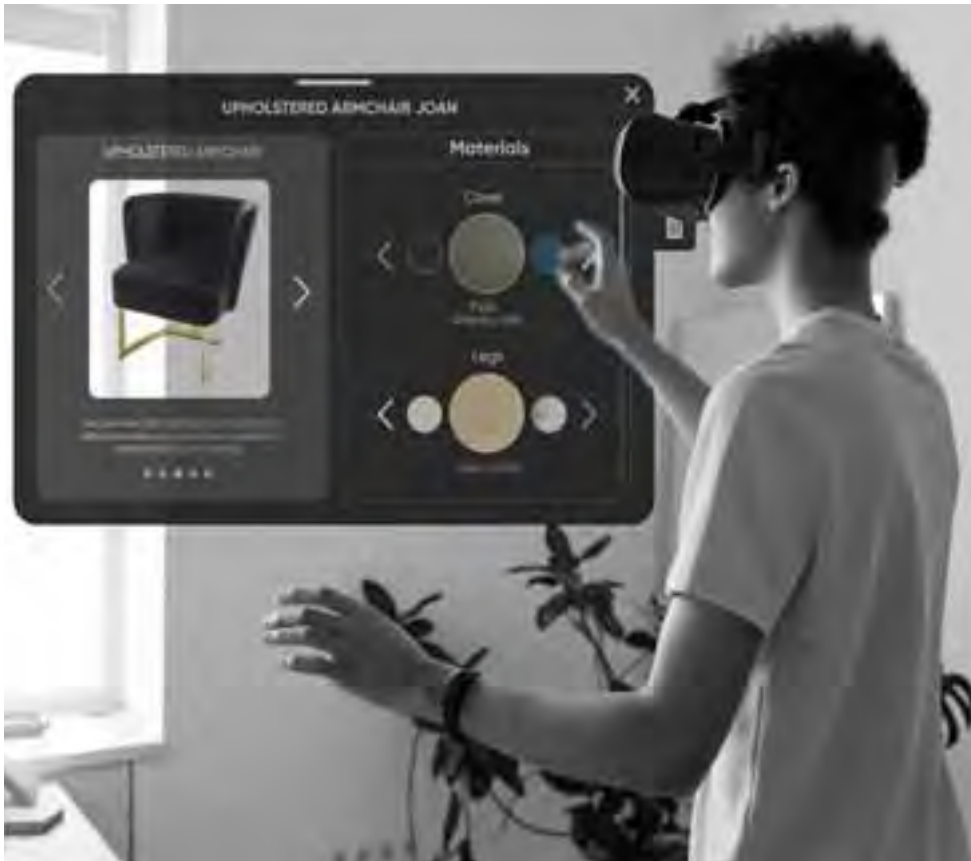
Fig. 12 | VR Application interface, COLUX project.

point of view, through the improvement of the end-user experience and the inclusiveness and involvement in product conception/design.