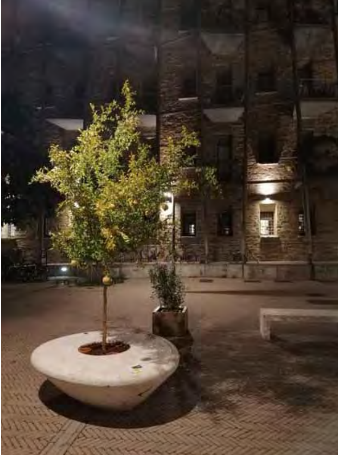
Fig. 5-9 | 'Water Value' and 'Litus' projects by Travertino Sant'Andrea, SMAG project.