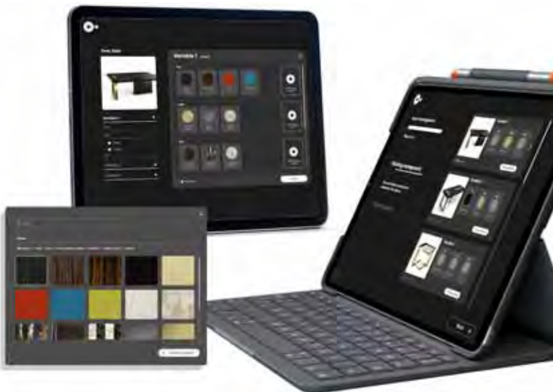
Fig. 14 | Interface for asset customization, COLUX project.

a ‘smooth’ transition between the preliminary design phase and the subsequent executive realization. In addition, the visualization of design products and designed spaces generates a virtual catalogue that the project community can access by taking advantage of the development processes in an experimental and innovative way (Fig. 14).