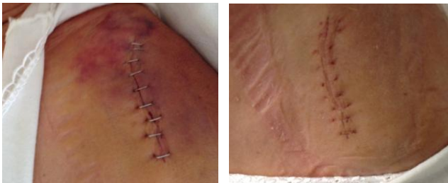
Figure 4 a/b - Patient who underwent reverse shoulder prosthesis at the beginning of PRFE treatment (day 1) and after 20 days PRFE therapy.

A study by Nicolle and Bentall (41) on surgical recovery showed that the extended-use of PRFE devices were able to control edema after blepharoplasty.