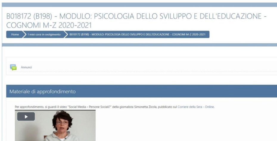
Fig. 2 Mock Ups for the Unauthoritative and Authoritative Contexts with Video Materials “Social Media=Social People?”