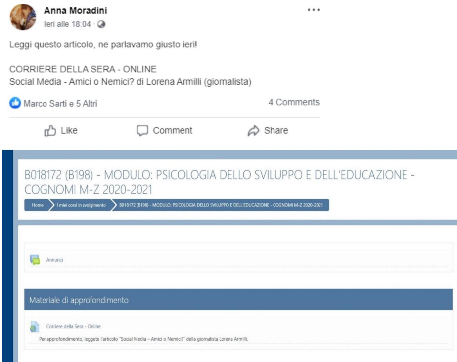
Fig. 1 Mock Ups for the Unauthoritative and Authoritative Contexts with Textual Materials “Social Media: Friend or Foe?”

Videos were “Internet videos” typically found on YouTube, in which the author speaks in front of a camera to give a presentation on a particular topic. No subtitles, graphics, animations, or seductive details were included, reducing extraneous cognitive load to a minimum. Participants could control the videos by stopping and re-watching them whenever they wanted.