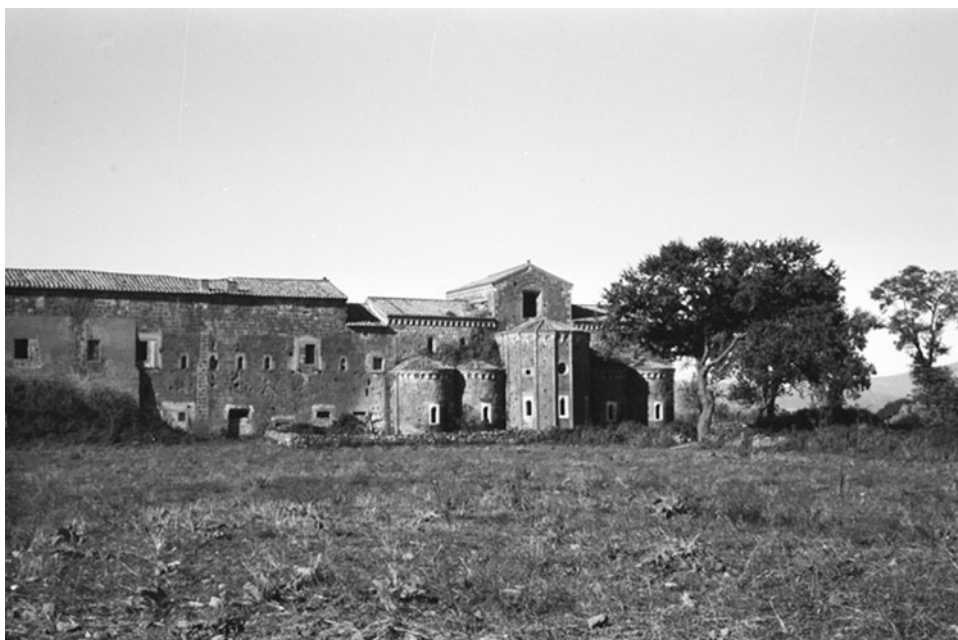
Fig. 4. Photo of the church and adjoining abbey of Santa Maria di Falleri, taken by John Ward-Perkins c. 1957 (BSR Photographic Archive, John Bryan Ward-Perkins Collection, wpset-0295.06).

Emblematic of the FNP's interests, in the summer of 2022, the first year of full excavation saw three trenches opened at Falerii Novi (Andrews et al., 2023; for locations, see Fig. 3). The first was located over a macellum structure between the forum and Santa Maria di Falleri (Area 1) (Fig. 4), the second explored a domus south of the forum area (Area 2), and the third a multifunction streetside intersection along the Via Amerina one block inside the south gate (Area 3), which contained possible shops, domestic structures, paved stretches of a secondary east–west side road, and the wider Via Amerina itself. The previously excavated insula XXXI (Area 4) was also subject to structural recording as described above, although no excavation was undertaken. This selection represented a desire to collect material stratigraphically from a range of urban spaces that take us beyond a limited selection of elite monuments and thus reveal a more ecumenical understanding of urban lifeways.