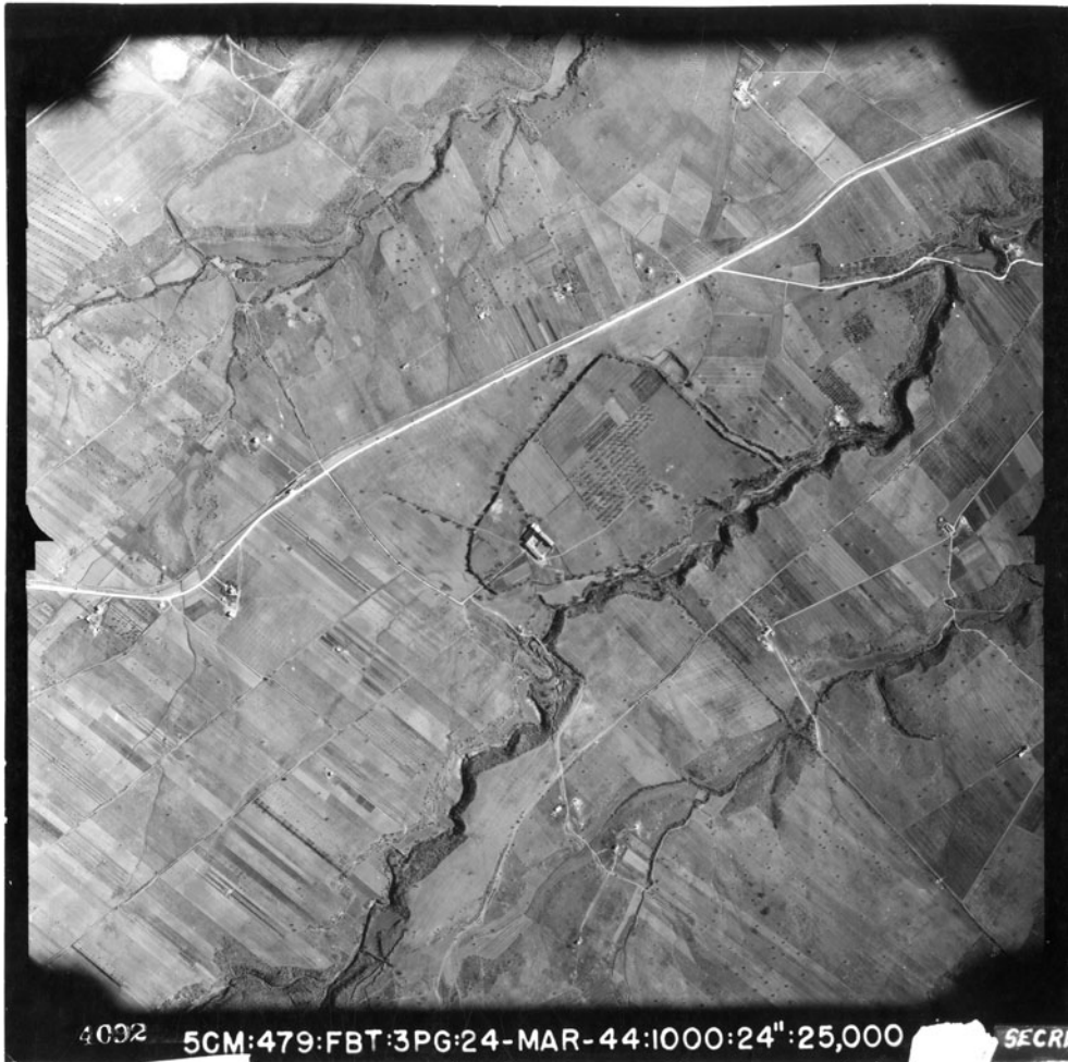
Fig. 2. Aerial photograph taken over Falerii Novi by the Royal Air Force on 24 March 1944. The outline of the city-walls is clearly visible along with the Rio Purgatorio valley.

From 1969 to 1975, the eastern half of insula XXXI (as defined in Keay et al., 2000, and by FNP as ‘Area 4’) to the east of the church of Santa Maria di Falleri was excavated by the Soprintendenza. The area opened by these excavations remains visible today (Fig. 3.1). Investigations exposed an intersection of the main east–west and north–south street axis (the so-called decumanus maximus and the Via Amerina), as well as a large complex built in opus quadratum immediately west of the forum’s southwestern flank, as identified by geophysical survey (cf. Keay et al., 2000; Verdonck et al., 2020). Only minor details of these excavations are published (Brunetti Nardi, 1972, 1981; De Lucia Brolli, 1995–6). Further work in this area was conducted by the Soprintendenza in 1989, at the northern and southern end of the excavated