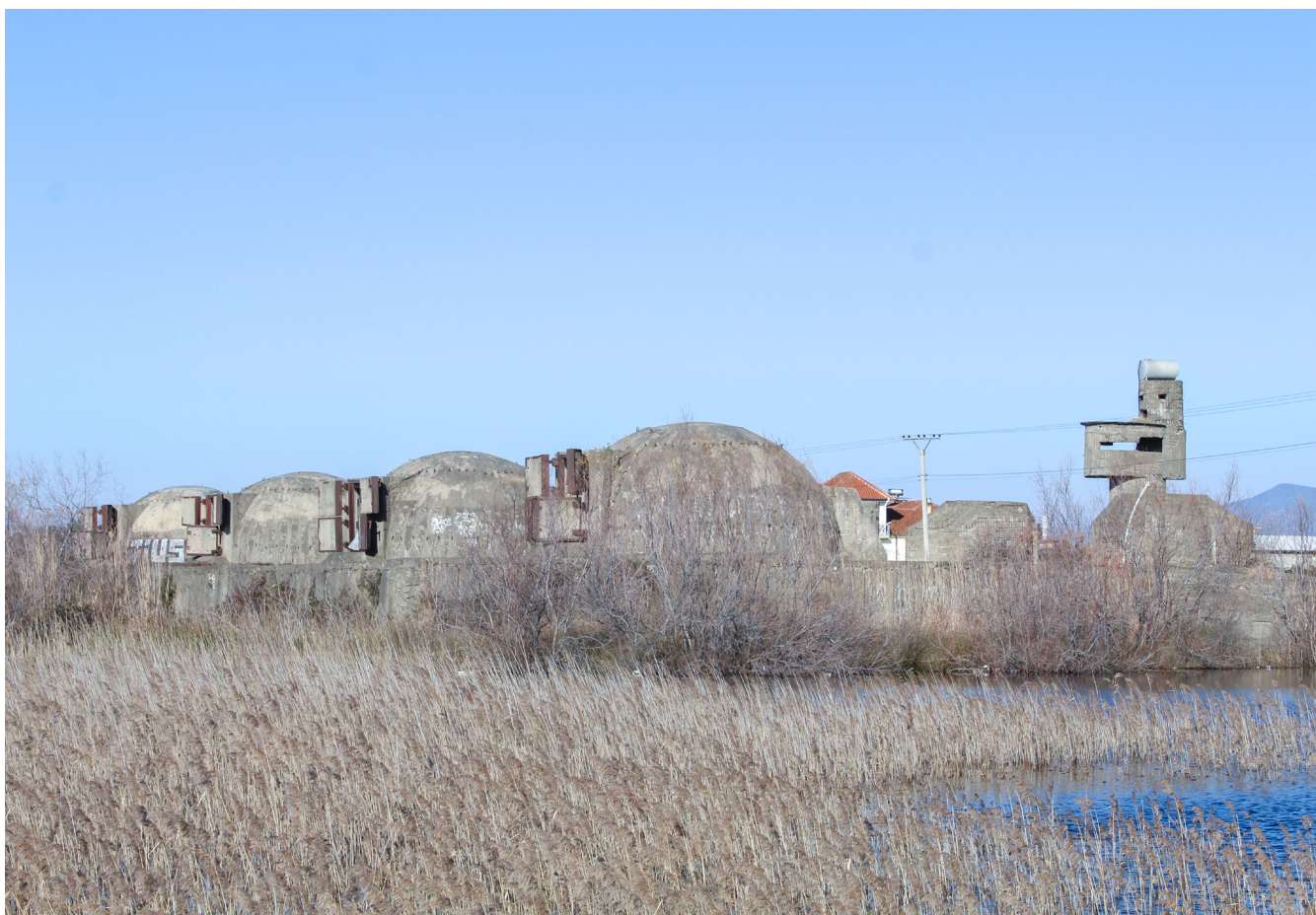
Fig. 5 Tale, Albania, Medium-sized bunkers called pikë zjarri , part of a special defensive structure.

trauma and its exhibition. Public reactions – including protests and acts of vandalism – demonstrate that these sites cannot be fully assimilated into a neutral or shared heritage framework, as they continue to operate as politically charged and affectively unstable spaces (Vokshi et al. 2021).