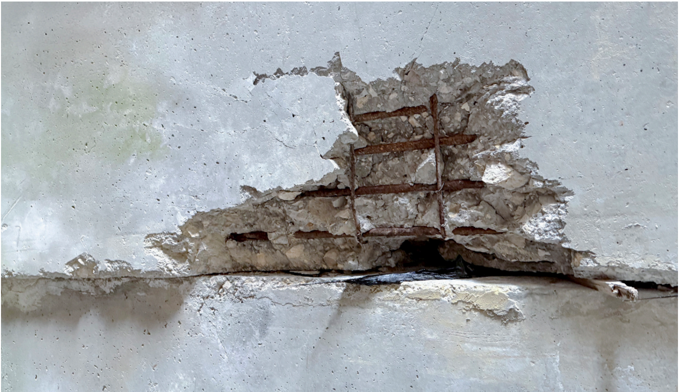
Fig. 9 Kepi i Rodonit, Albania, Detail of the deterioration of a bunker belonging to a special defensive structure.

The bunkers represent complex testimonies, charged with traumatic memories, political conflicts, and still unresolved identity-related meanings (Macdonald 2009). For this reason, their reuse cannot be approached exclusively as a functional or economic problem but requires the definition of guidelines capable of relating the conservation of matter, the persistence of meaning, and the transformation of use. In the absence of a shared critical framework, the risk is twofold: on the one hand, the banalization of these artefacts through interventions that erase their historical and symbolic specificity; on the other, their progressive marginalization and decay.