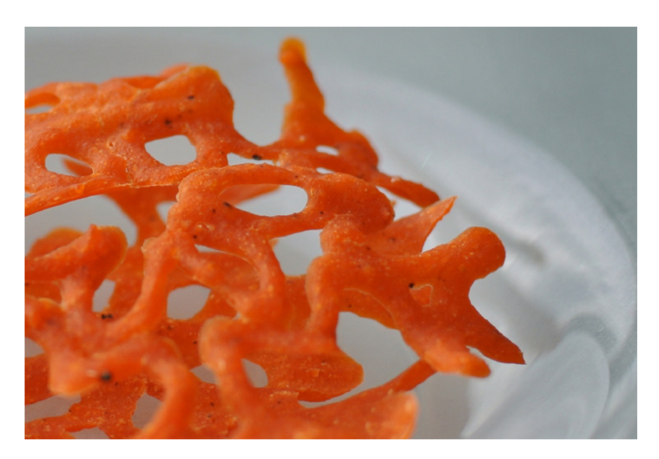
Figure 1 Detail of 3D printed food.