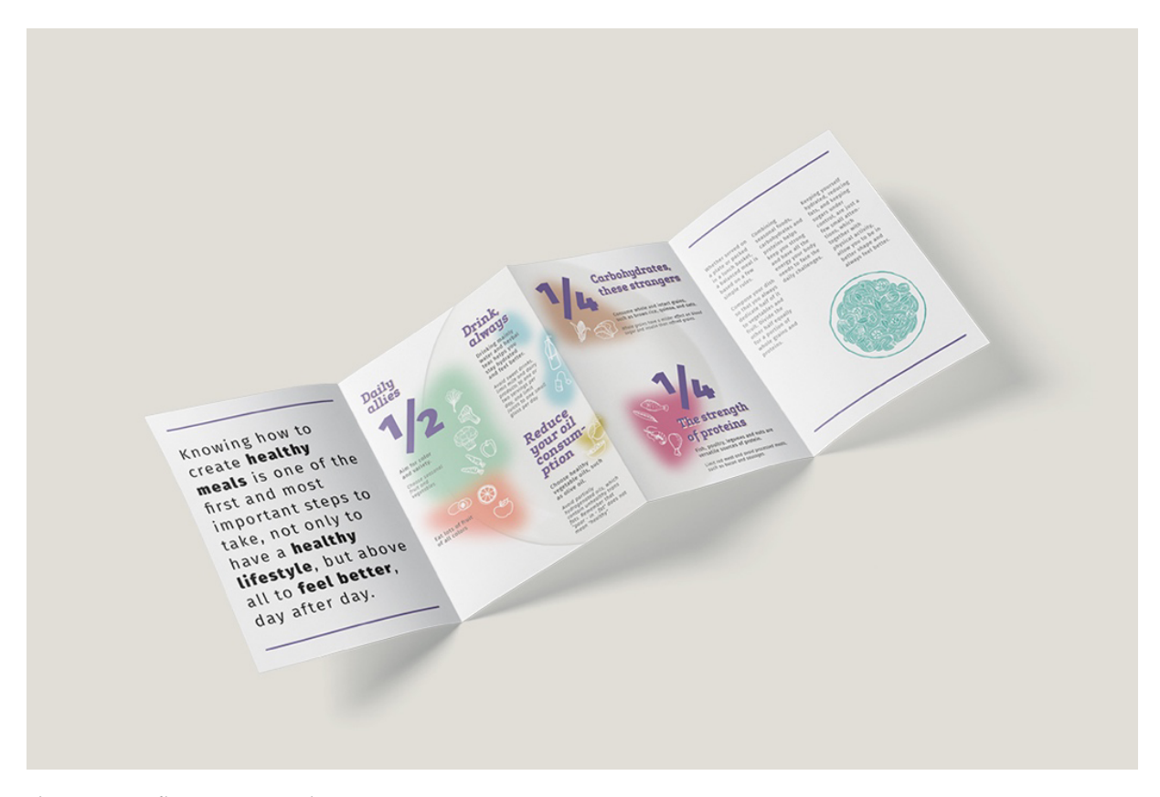
Figure 5 Leaflet portion and proportion.