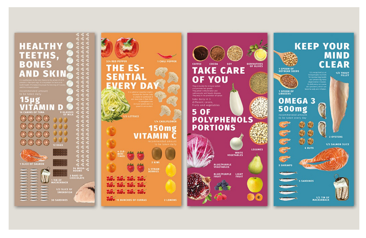
Figure 6 Food infographics.

Finally, have been created infographics on the theme of food for digital use, with a mixed graphic/photographic technique, designed to be used as popular artifacts on the most popular social channels. The infographics, designed to relate the number of different foods that allow meeting the daily requirement of vitamin C, D, polyphenols, and omega3, are characterized by the state of amazement that the user feels in understanding how even very different quantities of food can provide the same amount of vitamins or nutrients needed by the body (Figure 6).