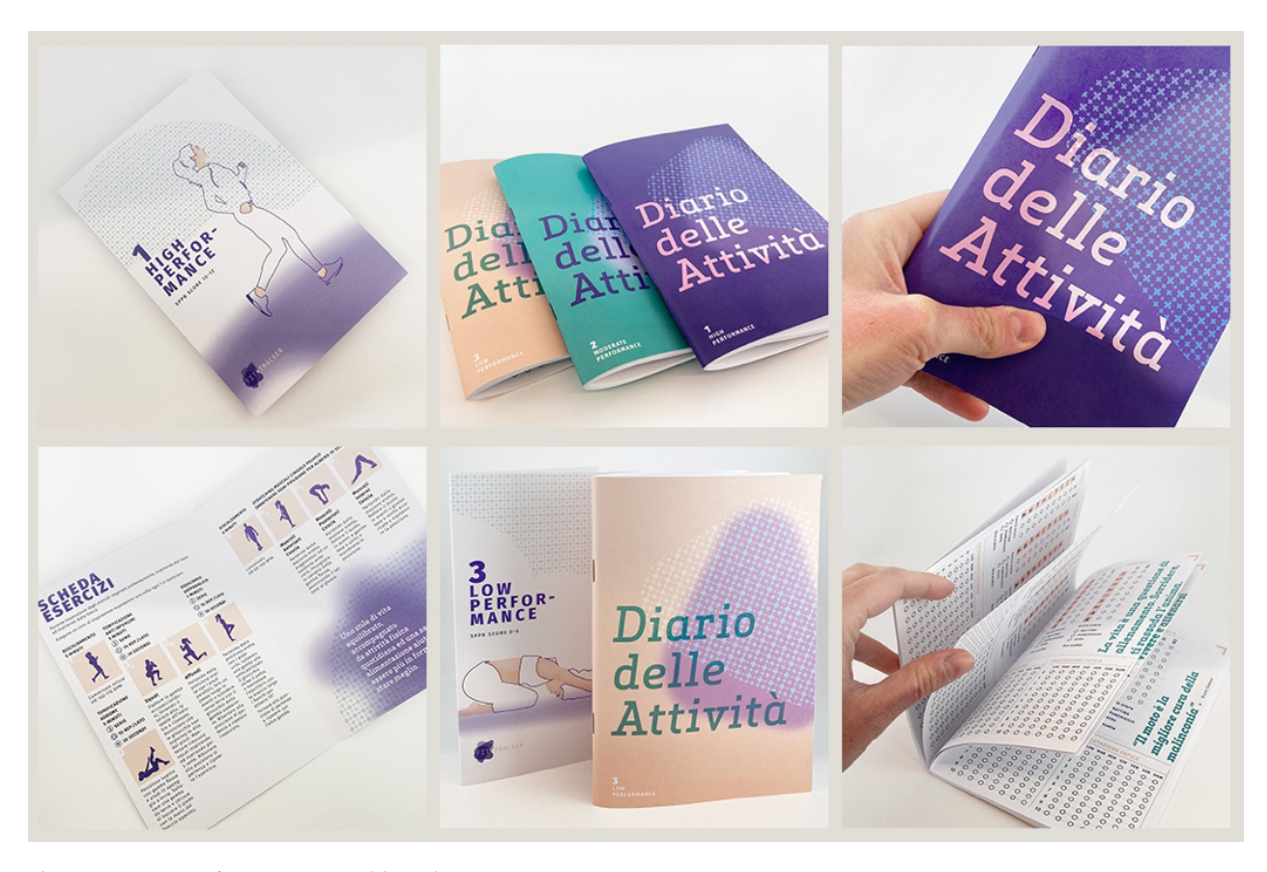
Figure 3 Diary of activities and brochure.

Another leaflet created is the guide to the ideal portions of food to maintain a healthy lifestyle. Thanks to the opening mode of this leaflet and the graphic style used, the hierarchy of information is articulated between external and internal, making it immediately clear that creating healthy meals is one of the first and most important steps to be taken not only for your physical fitness but especially for your health (Figure 5).