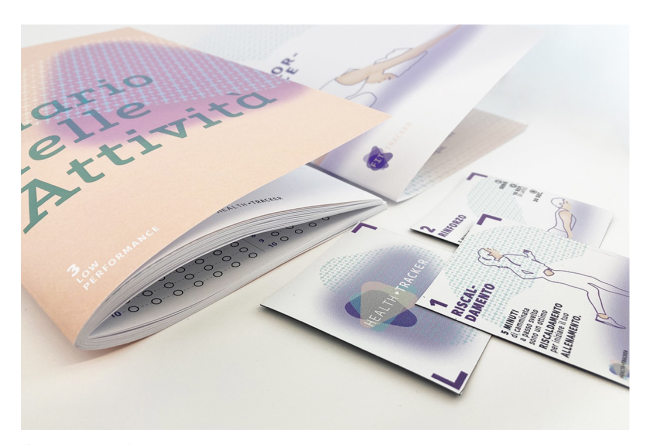
Figure 4 Activities kit.