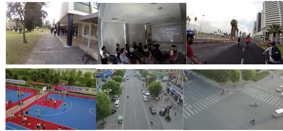
Figure 2: top) frames from the EgoSeg dataset; bottom) frames from the VisDrone dataset.

The expected goal, that was met, was to obtain improved or same quality and detection with ~30% bitrate. Table 1 summarizes results, showing how the goals were met in all the use cases.