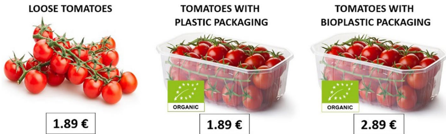
Fig. 1 Example of choice task

Imagine you are in the grocery shopping and you wish to buy 500g cherry tomatoes of Italian origin. Please, choose the alternative you prefer the most.