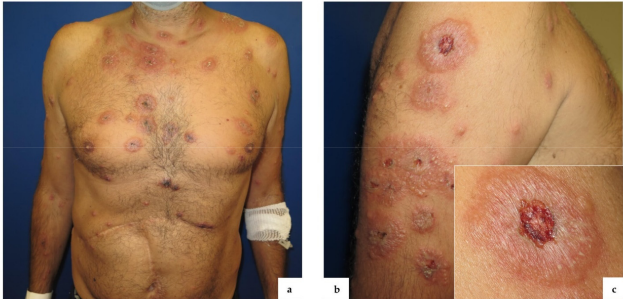
Figure 1. Well demarcated, targetoid lesions diffused to the trunk, neck (a), and upper limbs (b); BNT162b2 vaccine injection site (c).

immunofluorescence (DIF), alongside a peripheral blood sample for indirect immunofluorescence (IIF). Histopathology demonstrated a dense and diffuse mixed inflammatory infiltrate with a predominance of neutrophils, with subtle perivascular nuclear dust, dilated capillaries, and prominent edema of the upper dermis (Figure 2). Either DIF or IIF gave negative results. Collectively, the clinicopathological findings were consistent with a diagnosis of Sweet's syndrome.