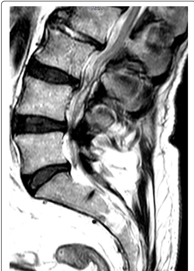
Fig. 2 The preoperative MRA shows severe narrowing of lumbar canal stenosis

dolorific hypoesthesia). The patient was transferred to the Spinal Unit, where a satisfactory recovery of the movements of the right leg was noted, whereas plegia of the left leg was still present. The patient was finally discharged in postoperative day 15th to a dedicated neurological rehabilitation center.