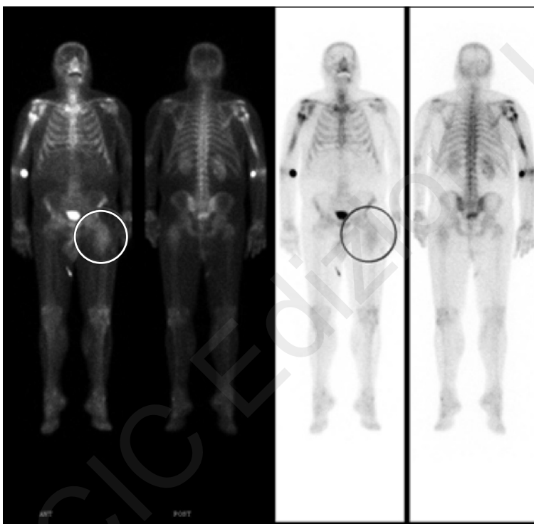
Figure 5 - Bone scintigraphy: uptake of left hip.

the hip even described. Moreover, this is a giant, 14-cm-long, MN, still the current available literature often refers to 5 cm as the maximum theoretical size of sporadic MNs (3). Bone erosion was reported in only one article (8), in which an intramuscular growth of a forearm MN was described; however, since no imaging is available, no further, exact data about bone involvement were provided. Differently, our radiological findings of complex, circumferential bone involvement with femoral neck deformation are extremely unusual, since sporadic MN usually is a well-defined mass that does