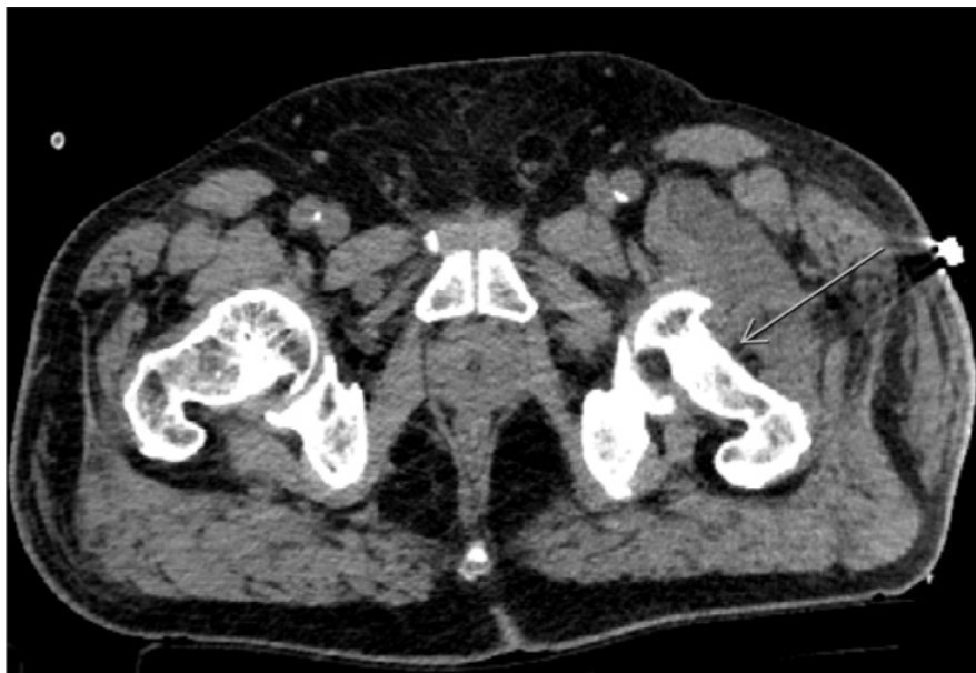
Figure 4 - Axial TC image where we can observe femoral neck thinning (arrow).