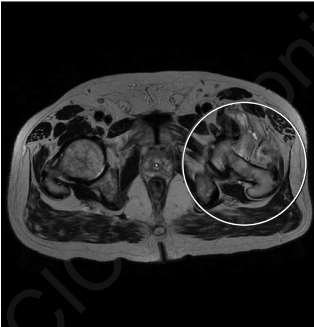
Figure 2 - Stick appearance of femoral neck on MRI. T2 weighted images.

contiguous bone. Overall, 22 cases of isolated MNs have been reported to date (Table 1), but to the best of our knowledge only 3 of them were seated in a deep position (8, 19, 21). In all reviewed cases (8-21), surgical excision was treatment of choice, in two of them recurrence was reported (10, 19), in one case due to incomplete excision.