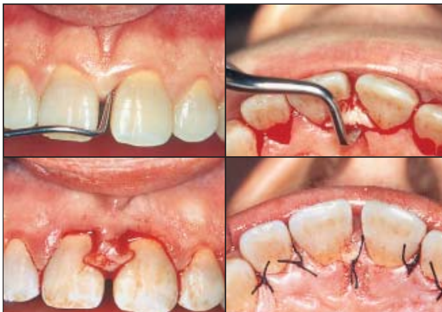
Fig 9 Top left: Papilla preservation technique: interproximal defect in a young patient. Top right: Palatal incision at the base of the papilla allows for elevation of a flap that includes the papilla itself. Bottom left: Palatal papilla is maintained. Bottom right: Palatal papilla is sutured in its original position.