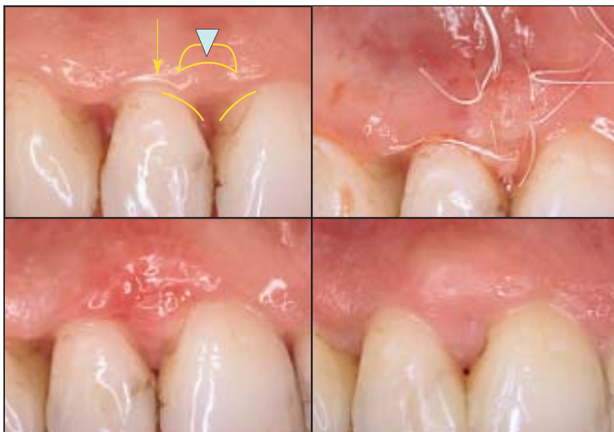
Fig 11 Top left: Technique to increase interproximal papilla: semilunar incision allows for positioning of a connective tissue graft beneath the coronally positioned interdental tissue. Top right: Interdental papilla at the removal of sutures after 2 weeks. Bottom left: Healing after 1 month. Bottom right: Healing after 3 months.