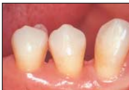
Fig 7a (left) Modification of interdental space by means of orthodontic treatment: clinical case before therapy.