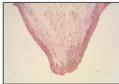
Fig 5 (right) Histologic aspect of interdental papilla (hematoxylin-eosin stain; original magnification \times 80 ).

whereas the projection of the cervical one shows an acute angle (Fig 2). On an occlusal plane, the projection of the buccal pyramid shows an open angle, whereas the projection of the palatal one shows an acute angle (Fig 3). A point or area of contact near the occlusal plane and located buccally tends to open the angle of the occlusal and buccal pyramids. On the other hand, a point or area of contact situated in the middle third of the crown makes narrower occlusal and buccal pyramids. This reduces the cervical pyramid and favors food retention. These morphologic characteristics must be taken into consideration when