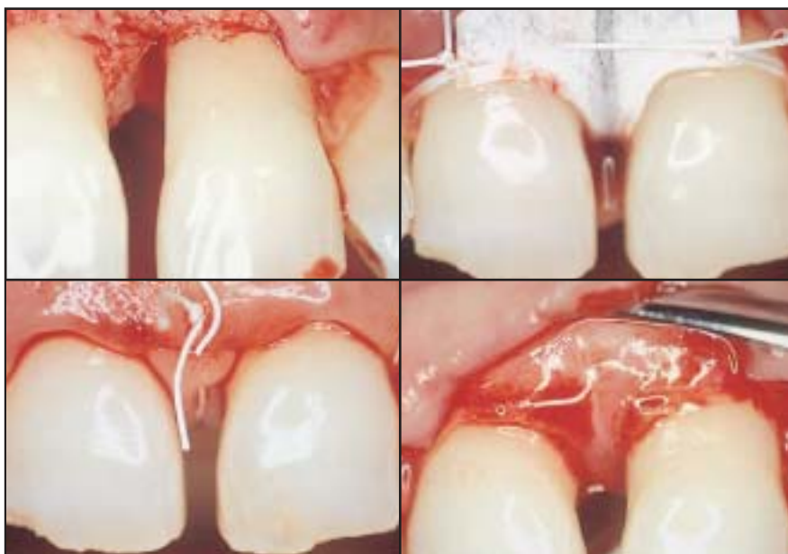
Fig 10 Top left: Modified papilla preservation technique: initial incisions, flap elevation, and defect debridement. Top right: Nonresorbable membrane is shaped and positioned onto defect. Bottom left: Palatal papilla is sutured. Bottom right: Newly formed tissue at reentry procedure 6 weeks later.