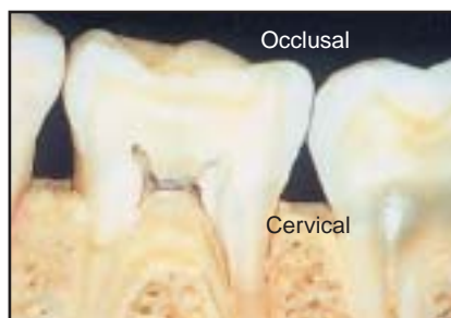
Fig 2 On a sagittal plane, projection of occlusal pyramid shows a slightly open angle, whereas projection of cervical one shows an acute angle.