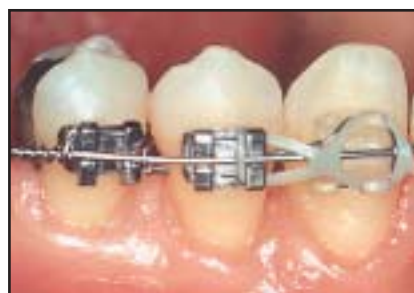
Fig 7b (right) Closure of diastema causes coronal creeping of interproximal gingival tissue.

the inflammation. In these cases, interdental papilla reconstruction is not the main goal of the comprehensive treatment plan.