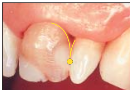
Fig 6a By restorative/prosthetic rehabilitation, contact point may be lengthened and located more apically, allowing coronal displacement of interdental gingiva.