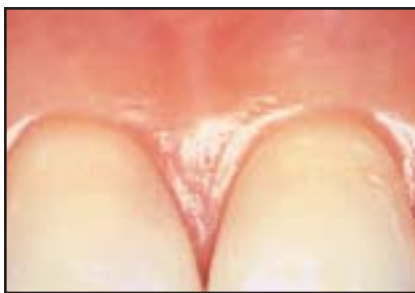
Fig 4 (left) Clinical aspect of interdental papilla.