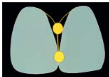
Fig 6b Schematic movement of contact point.