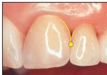
Fig 6c Final result of prosthetic reshaping of the lateral incisor, with consequent coronal displacement of the interdental gingiva.