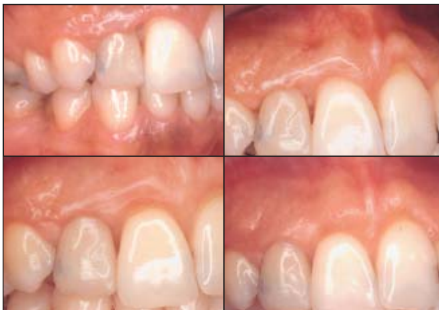
Fig 8 Top left: Loss of interdental papilla between maxillary lateral and central incisors. Repeated curettage of the interdental papilla was performed every 15 days. (Courtesy of Prof M. Caffabriga.) Top right: Same case after 1 month. Bottom left: Same case after 2 months. Bottom right: Same case after 3 months. Complete regeneration of the interdental tissue is achieved.

To optimize the clinical results in terms of attachment/bone gains and soft tissue preservation, Cortellini et al 10 published a modification of Takei et al's technique as a new approach for interproximal regenerative procedures (the modified papilla preservation technique). A horizontal incision is performed on the buccal papillary tissue at the base of the papilla. A full-thickness palatal flap, which includes the interdental papilla, is elevated. A buccal full-thickness flap is elevated with vertical releasing incisions and/or periosteal incisions, when needed. A barrier membrane is positioned to cover the defect. The interdental tissues are repositioned and sutured to completely cover the membrane. A horizontal internal crossed mattress suture is placed beneath the mucoperiosteal flaps between the base of the palatal papilla and the buccal flap. This suture relieves all the tension of the flaps. A second suture (vertical internal mattress