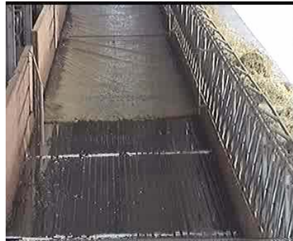
Figure 3. Flush wave on the feeding alley without manure present