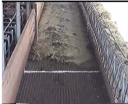
Figure 2. Flush wave on the feeding alley with manure present

Figure 2 and 3 show the flush wave on the feeding alley respectively with and without the manure presence. The pictures depict different characteristics in the regularity of the moving flux on the surface, the advancing front results disturbed by the presence of manure on the floor.