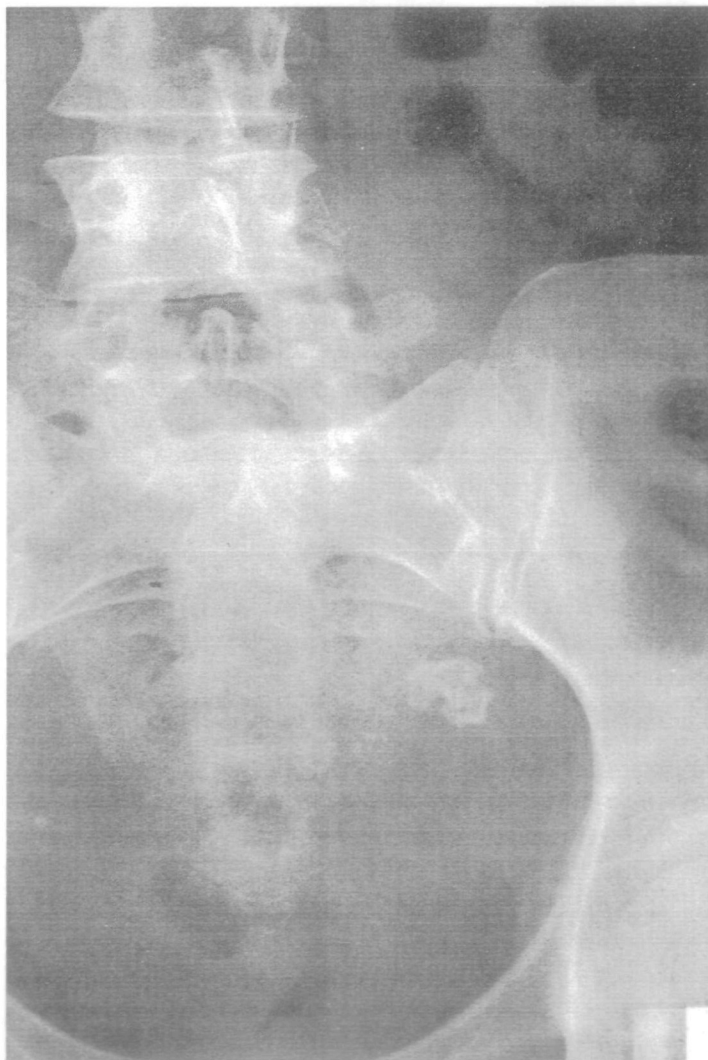
Figure 2. Radiogram of the abdomen (upright view) showing a round-shaped non-homogeneous calcification in the left pelvis, 30 mm in diameter.

lutea, we found a partially opened cyst 5 cm in diameter containing yellowish fluid, which was strongly suggestive of a dermoid cyst. Bilateral ovarian resection was performed in order to remove the cysts. Appendicectomy and accurate abdominal lavages with Ringer solution were performed before completing the intervention. In the following 2 days the patient's body temperature returned to normal values; white cell count fell to 7200/mm 3 on day 7 (Table I). The patient was discharged in a good state of health on day 9. Microscopical examination of the ovaries showed the presence of two dermoid cysts.