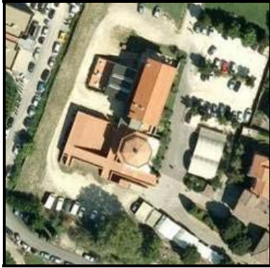
Fig. 1 – Misericordia of Badia a Ripoli

The Misericordia has a central building which is mainly used for outpatient assistance, and a “secondary” one, used for all administrative activities (Fig. 1). The main purpose of the SHC installation is to integrate cooling energy and heat from the plant to the existing air-conditioning system (vapor-compression and heat pump devices) for the central building.