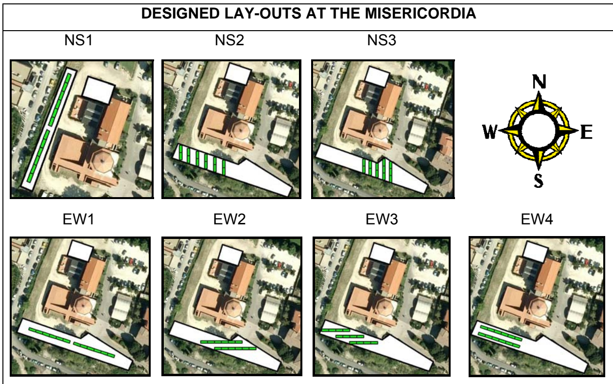
Table 2 - Designed Lay-Outs for the solar field