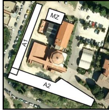
Fig. 2 - Installation Areas

There are only few possibilities for the installation of the solar field, and all the other components of the SHC plant (Fig. 2): In the west side of the main building there an almost rectangular area (A1), tilted about 20° in respect of the NS direction (it is the area preferred by the Misericordia for the installation of the solar field). In the south-side there is a larger area (A2) oriented perpendicularly to A1, used as parking for ambulances and services vehicles (it will be necessary to design and construct an over-elevated steel structure, almost 4 meter high, in order to allow the parking).