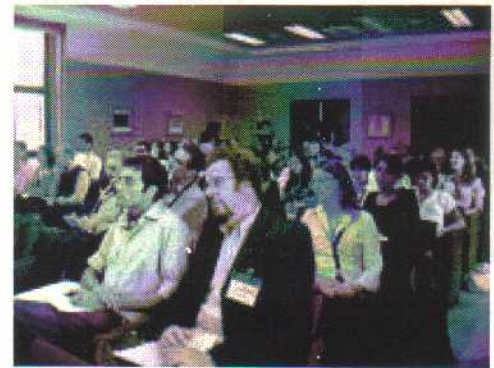
A picture from the meeting.

More information about the conference [in Italian]: http://www.statistica.it/qol