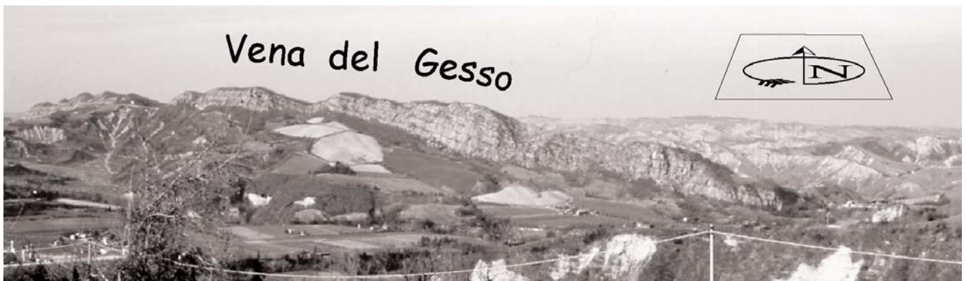
Fig. 1 - Panoramic photograph showing the characteristic appearance of the Vena del Gesso monocline.

Moreover, the experimental results evidence the major role played by syntectonic erosion that dictated the deformational style. This is illustrated by two models (VdG04 and VdG 05) sharing the same initial set-up, velocity of deformation and bulk shortening, but erosion was applied to the internal sectors of model VdG-04 only. The comparison of top view photographs and cross sections (fig. 3) between the two models highlights that model VdG-04 developed a quite different structural architecture in respect to the other (model VdG05), thus