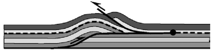
Fig. 2 - Schematic cartoon illustrating the passive-roof thrusting concept.

In conclusion, we suggest that the dominance of back-thrusting characterising the Vena del Gesso area is consistent with the development of a thin-skinned passive roof duplex, in which the erosion acted as one of the main driving factors.