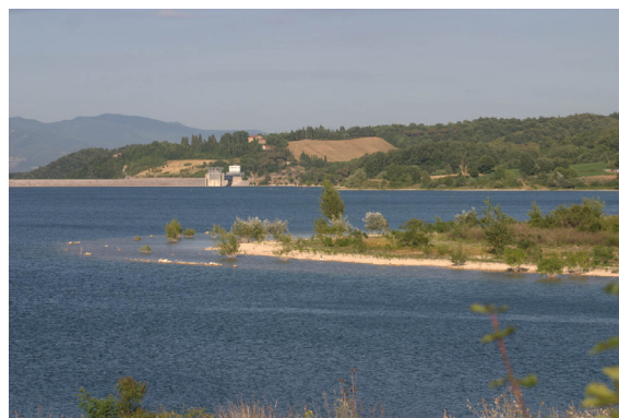
Figure 1. View of Lake Bilancino (Tuscany, Central Italy).

Dikerogammarus villosus is the only gammarid in the lake, while the indigenous species Echinogammarus veneris is reported in the rivers of the same basin (Ruffo and Stoch 2005). During October 2008 and April 2009, we sampled four sites (two on the Northern side, two on the Southern one) along the littoral area of the lake. Sampling was performed up to 2 m from the banks and from 0 to 60 cm depth in areas where gammarids seemed most concentrated. Individuals were collected using a hand net (0.5 mm mesh size) in a square transect of 50×50 cm randomly sorted, and preserved in vials with 75% ethanol; then, in the laboratory, under a light microscope, their sex and maturation level were analyzed. The mean density did