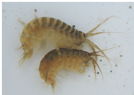
Figure 3. Two mating individuals of Dikerogammarus villosus : the male (the biggest and striped shrimp) is guarding the female.