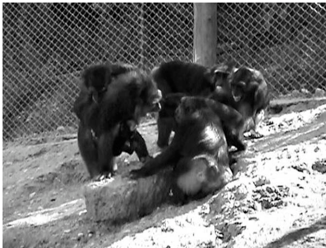
Fig. 1. Example of multiple affiliative interactions between groupmates at the time of collective arousal.

We quantified the behaviors occurring during arousal and control periods from video records. We measured the frequency per minute of brief behaviors for each individual: mount, clasp (an individual gently grasps another, passes one or both arms around her/his body, or embraces her/him), affiliative facial display (lip-smack, silent