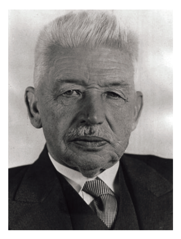
Figure 1. Karl Albert Ludwig Aschoff. Image in the public domain. Details available at: http://en.wikipedia.org/wiki/File:Ludwig-aschoff.jpg.

anatomy, he was one of the most known German doctors of his time, not only because he had worked abroad for a long time but also because pathology was one of the fundamental disciplines in the medical sector during the first decades of the 20th century. He was very active until his retirement at the age of 70. As with other historical instances illustrated in this article, Aschoff gave his name not only to physiological structures, such as the Aschoff-Tawara node [Aschoff 1906], but also to pathologic ones, such as the Aschoff bodies, which are observable histologic lesions characteristic of rheumatic carditis that Aschoff described in 1904 [Aschoff 1904].