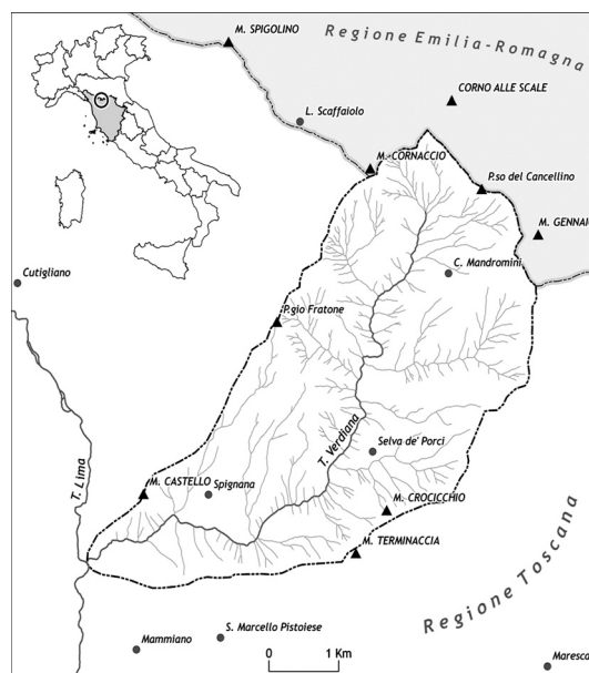
Figure 1. – Study area.

From the analysis of data from 20 thermometric and 40 pluviometric stations in the Pistoiese