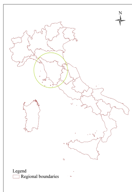
Figure 1. Study areas.

The Garfagnana is a typical example of wooded zone placed in an area of particular environmental value. The area’s touristic attraction is focused on the discovery of its natural heritage, Garfagnana is an historical region of Italy, today part of the province of Lucca in the Apennines, in northwest Tuscany, and it is one of the rainiest regions of Italy, so it is largely covered by forest vegetation (mainly Chestnut, Oak and Pine). It is a mountainous region of Tuscany located between the Apuan Alps the main part of the Apennines. The total area is 53,377 hectares of which 38,032 ha (71.25%) are occupied by the