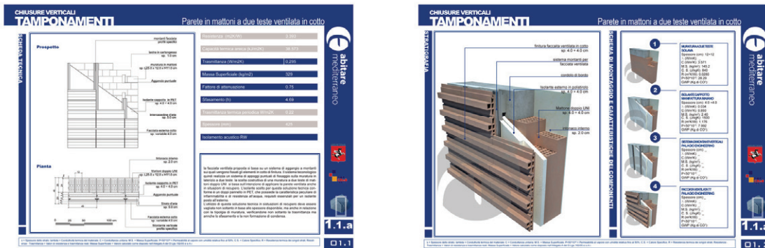
Fig. 5. First (a) and second (b) section of data sheets

With this analysis are developed a research activity to identify weaknesses of products and components, to propose innovation at companies or identify new firm, in specific sector, that would be associated at research "Abitare Mediterraneo".