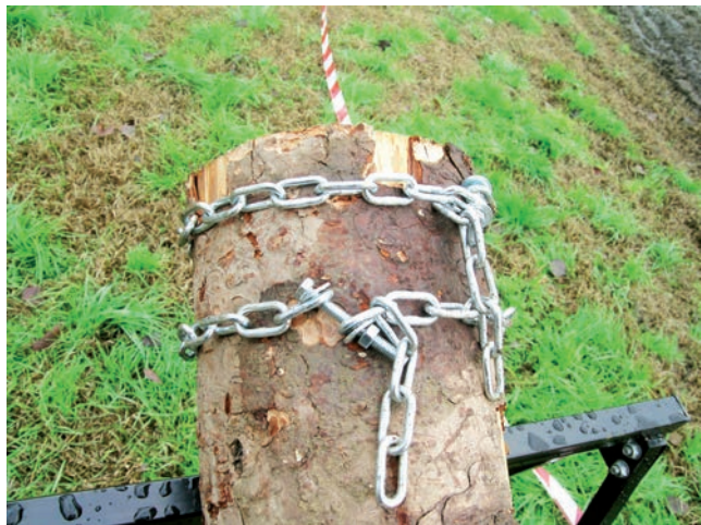
Figure 4. Pile head frettage.