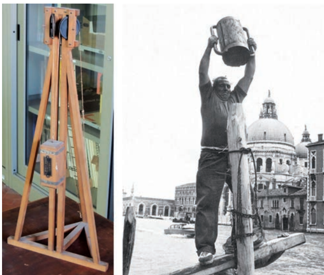
Figure 1. Pile driver model, owned by the GESAAF, and a present-day hand operated pile driver in Venice.

The 3 elements TR1, TR2, TR3, which constitute the truss, were constructed using prefabricated elements, to which the rail of the hammer stroke and the pulleys on the head have been applied. It was decided to use these prefabricated elements in order to reduce the process-