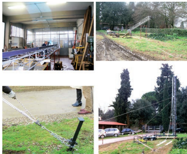
Figure 3. Pile driver under construction; uplifting; stays hooking system, and pile driver in working position.

The floating pier could not be built in Firenze because the shipping costs would have far exceeded the cost of construction. However, the extreme simplicity of the structure allows that it is made in-situ with ease and economy.