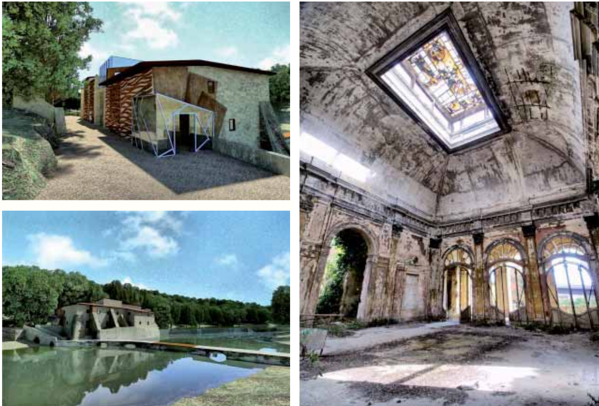
Fig.2 - On the left: two view of the recovering idea for the Bruschetto Mill. On the right: the main hall in the "Terme del Corallo", Spring 2011