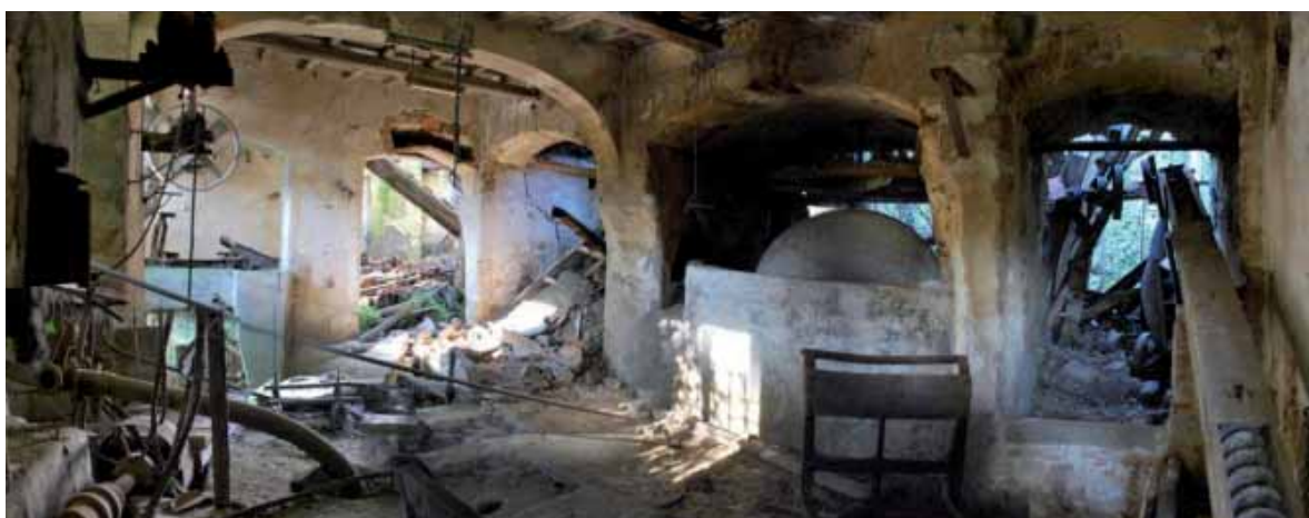
Fig.1 - View from the river of the Bruscheto Mill, autumn 2012; View of the inside of the Bruscheto Mill, autumn 2012