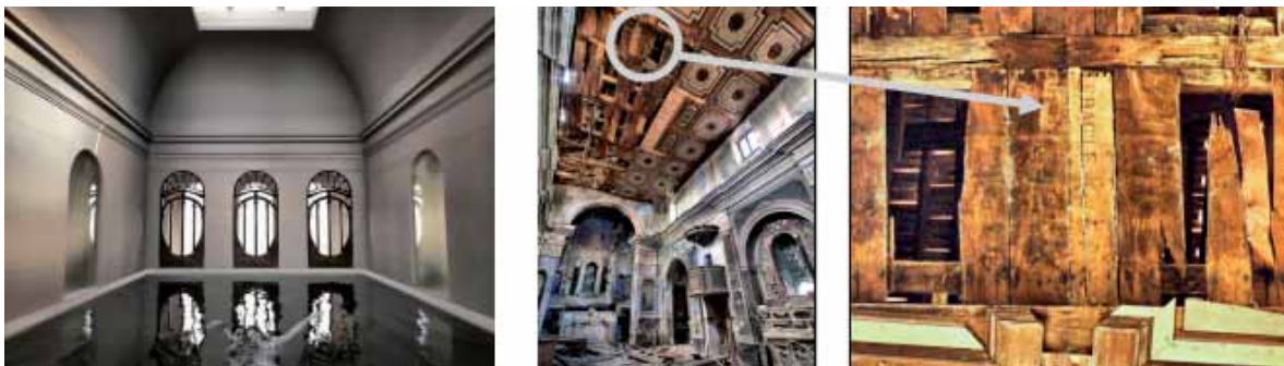
Fig.3 - On the left: a view of the recovering idea for the "Terme del Corallo". On the right: Irpinia, abandoned church, winter 2012

symmetrical staircases can be the entrance to the conference hall. The "new Terme del Corallo" is imagined as a contemporary baths/spa with multiple functions inside. In the central building there are thermal baths; the main hall became the internal swimming pool offering a spectacular space to the visitors, the corridor in front of the swimming pool is closed with large glass becoming the reception, all the other spaces orbited around these elements. The main function of "baths" is restored, the lost water table is substituted using sea and treated water creating a place with a strong appeal for the tourists and for the locals.