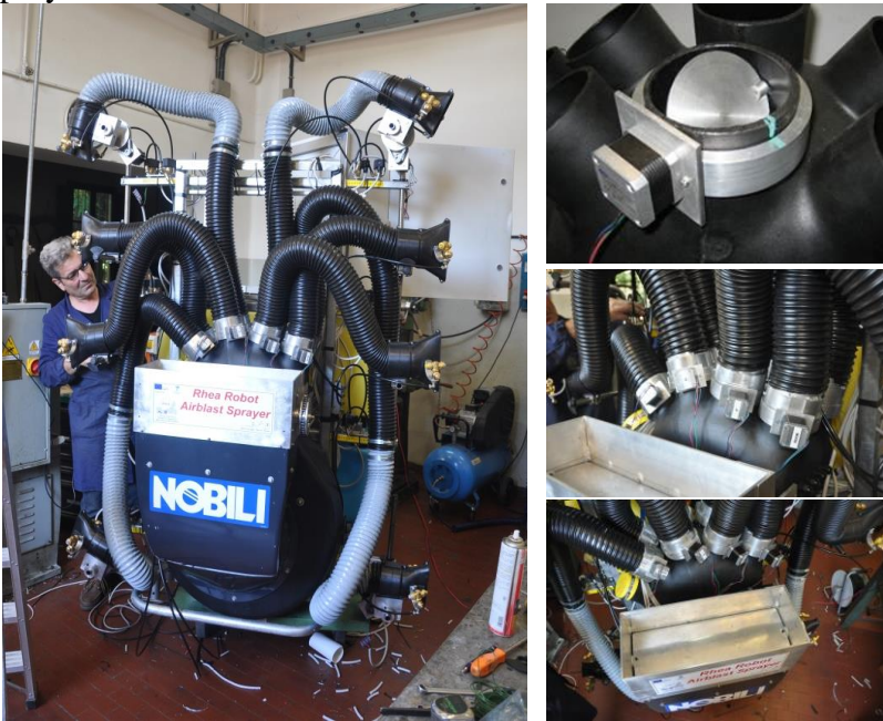
Fig. 4 – the 1° RHEA airblast sprayer prototype (left).

The 8 US sensors could be replaced by on board LIDAR or by a remote control directly send by the HLDMS (High Level Decision Making System) that could use the LIDAR on the scouting Aerial Unmanned Vehicle to provide a 3D prescription map able to command the different operating system of the air sprayer in the different vertical bands.