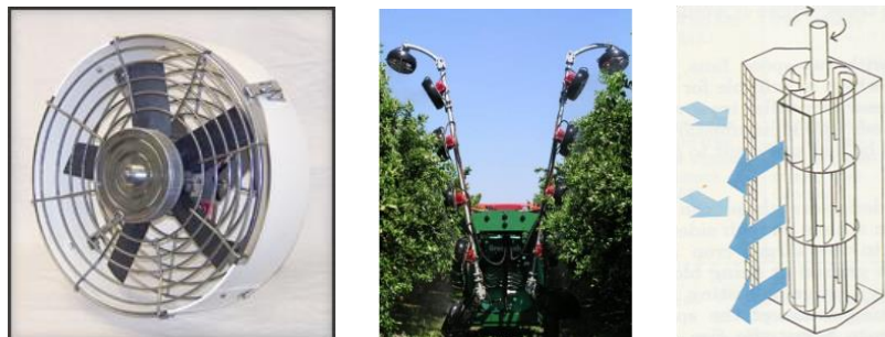
Fig. 2 a,b,c: Protec, Sardi and Tangential (cross flow) fans.

Where finally defined rules for each devices to better fit optimum spray features on each vertical bands of the canopy.