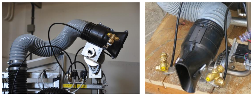
Fig. 6 – tilt diffusor ( left ) with double nozzles ( right ).

Particular interest is placed on airjet vector characterization and its effect on the canopy by means of the butterfly valve control on each single side band.