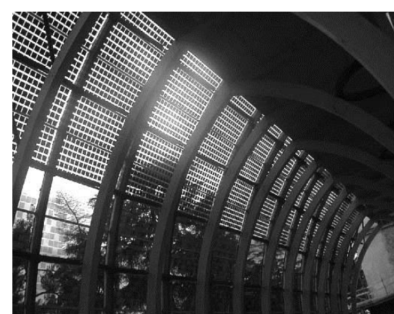
Figure 3: The PV plant integration in the greenhouse

Finally specific grids are provided in the glazed roof in order to reduce night condensation on the internal glass surface. If all these measures will be correctly adopted there will be a good habitability in summer as well.