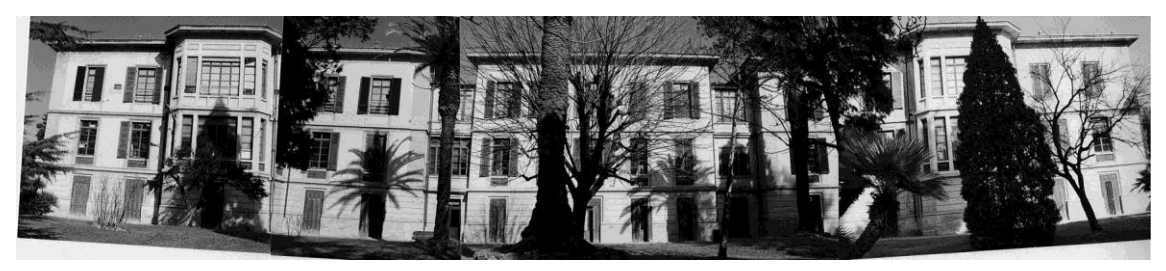
Figure 1: The building before the refurbishment

administration office of the new adjacent Paediatric Hospital, The Meyer Hospital, that increased in the extended area of the Medical Scientific University Pole of Careggi in Florence (fig. 1).