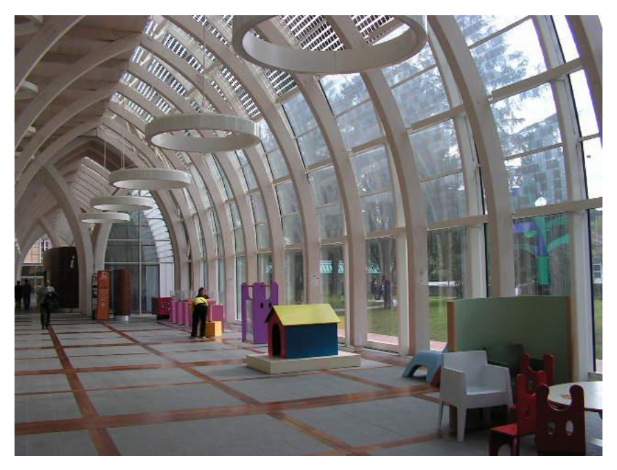
Figure 3: View of greenhouse's interior