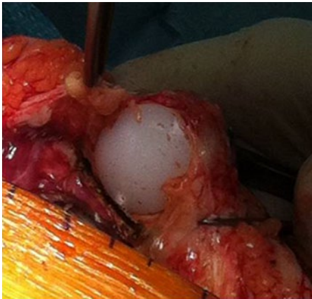
Fig. 3 Left knee. Removal of fibromatous intra-articular tissue (“Clunk syndrome”)

fracture at 14 months from the index procedure. The fracture was treated conservatively, but the patient reported severe anterior knee pain at follow-up. This patient was in the CT study group too: the femoral component positioning in relationship to the trans-epicondylar axis at follow-up showed only 2.60^\circ of external rotation. The other three patients in this group had mild to moderate painful crepitations during daily activities, but were not part of the CT study sub-group, so the authors were not able to investigate a possible rotational malalignment of the components.