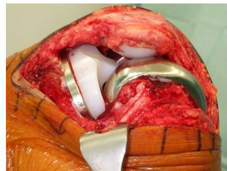
Fig. 2 Right knee. Patellar tracking in deep flexion showing full congruence in the trochlear groove

knee prostheses were performed on 100 consecutive, non-selected patients after approval from the institutional review board (IRB). All patients gave their informed consent prior to their inclusion in the study. The indications for surgery were advanced degenerative change with severe pain on weight-bearing, impaired knee function and limitation of daily activity. The preoperative diagnosis in this consecutive series was always osteoarthritis. The patients’ mean age at surgery was 73 years (range 55–87 years). There were 67 females and 33 males in the study group. Patients’ preoperative Knee Society Score (KSS) and Knee Society functional score (KSFS) were recorded. The surgical approach included a standard midline skin incision and a medial peripatellar capsulotomy, consistently avoiding standard lateral releases. The Sigma HP instrumentation was used to allow 3° of external rotation to the cemented femoral component and the “balanced gaps technique” was the chosen surgical technique. The tibial component rotational alignment was set matching the tibial anterior cortex (Fig. 1) with its anterior side (“curve-on-curve technique” for rotational alignment) [13]. The desired tibio-femoral AP axis was set at 5° of valgus, which has been shown to be safe in primary TKA