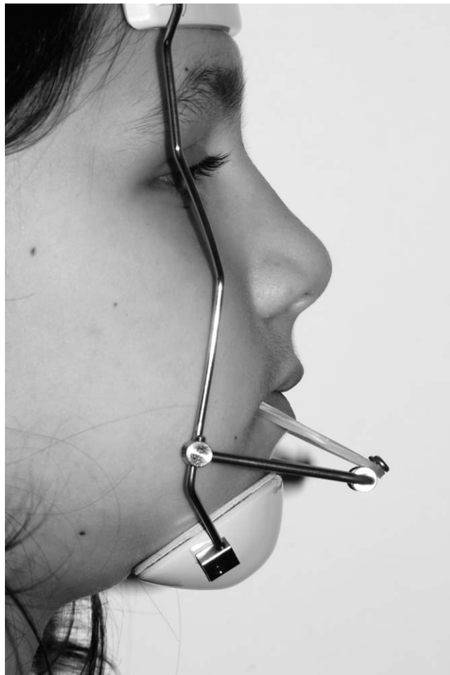
Figure 3. Extraoral lateral view of facemask.

patients were treated to at least a positive dental overjet before discontinuing treatment; most patients were overcorrected toward a Class II occlusal relationship. Average duration of the RME/FM treatment was 1.1 years \pm 5 months.