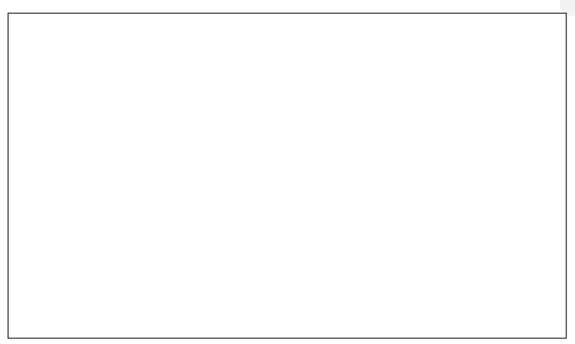
Fig. 2: Simplified correlation matrix for teaching support tools focus group

The analysis of the correlation matrices permitted to better define the following project steps towards some specific items, directly obtained from the CTQ analysis. In particular, the main results could be summarized as follows: