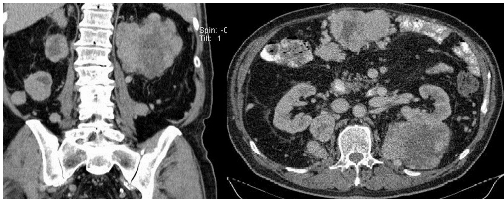
Fig. 1. Abdominal CT scan.

the posterior aspect of the left kidney was occupied by an expansive process penetrating the para- and perirenal space with a maximum transverse diameter of 11 cm. The lungs were involved with lesions of secondary aspect with intense contrast enhancement and subcutaneous tissue was characterized by multiple lumps ranging from 1 to 10 cm. Surprisingly, the liver, pancreas, spleen and bladder were free of pathologic findings.