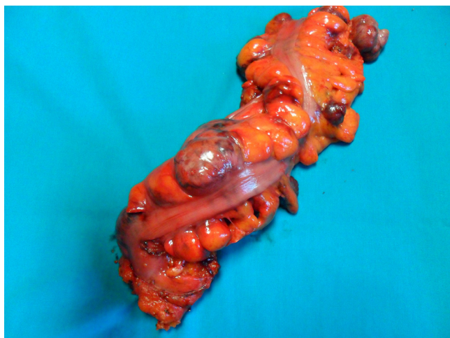
Fig. 5. Sigmoid colon metastases.

Although there is still no clear consensus about the use of metastasectomy, this would be a valid option, as supported by several studies and recent guidelines [8,4,13] and by the fact that until today, the treatment of metastatic renal carcinoma with systemic therapy has been rather unsuccessful. Recently introduced targeted therapies are problematic because of side effects and their need to