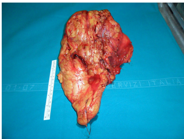
Fig. 4. Left kidney.

and complex lymphatic drainage. However, there is a predilection for certain metastatic sites such as the lung [75%], bone [20%], liver [18%], cutaneous sites [8%] and central nervous system [8%] [3]. As a result, atypical metastases are considered those localized in a site other than thoracic, skeletal, hepatic, adrenal or encephalic [8]. The peritoneum, gut, mesentery and omentum are atypical sites and extremely rare, affecting only 1% of patients with metastatic renal cancer upon autopsy examination. Peritoneal and retroperitoneal diffusion is associated with poor prognosis [9–11]. Our review of the literature was unable to find any cases of indolent diffuse renal cancer simultaneously involving the peritoneum, retroperitoneum, omentum, lung, subcutaneous tissue, colon and adrenal gland but with no liver and bone involvement. Our case is probably one of the first reported. In such cases, it is always challenging to decide which therapy is the best choice, especially when a surgeon is requested to perform a non-codified surgical procedure. The treatment of metastatic renal cancer is still controversial since large series of metastasectomies are reported in the literature, but little is known about the management of metastasis in atypical sites [8,12].