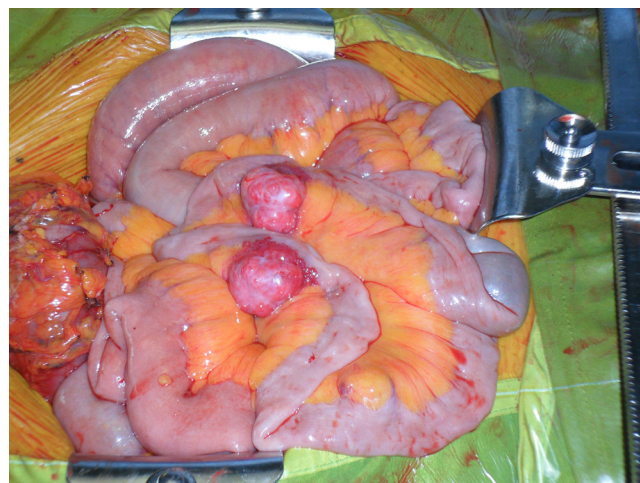
Fig. 3. Mesenteric metastases.

Metastatic renal cancer is a relatively common event with more than 30% of patients presenting with a metastasis at the time of diagnosis, even with non-palpable and asymptomatic renal mass. As explained by Krumerman and Garret [7], the pattern of spread is almost always unpredictable, mainly due to deep angioinvasion