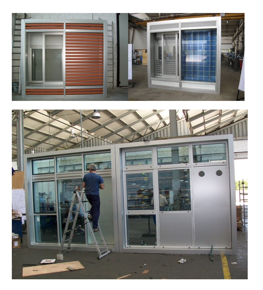
Figure 1. Integration of tim materials (left) and heat exchanger (right)