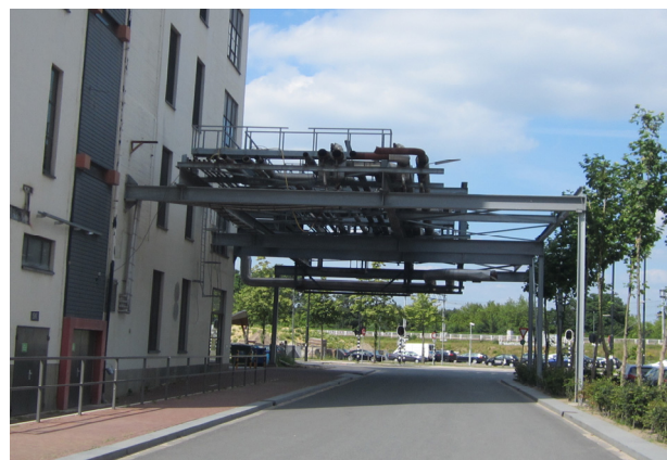
Fig. 6 Strijp S: the roof of pipelines and ducts will be kept as a historical artifact.