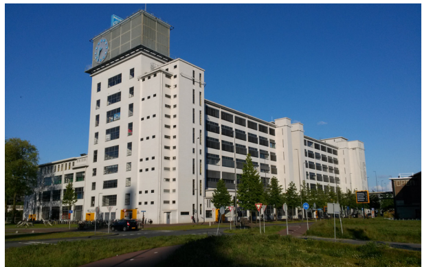
Fig. 2 Strijp S: the Klokgebouw building which is the emblem of Philips Electronics Factory.