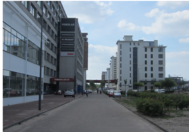
Fig. 8 Strijp S: the main entrance to the creative urban quarter and the High Spine in high back.

In the specific case of Strijp S, the unique perception of tangible and intangible heritage gives a sense in terms of both art and utility. The use of green landscape and lighting in the public realm, in order to highlight both past and present, is also expression of sensitive thinking of art and design (Fig. 8). Art and design is created as an expression of local exploration of a proper creativity and to multiple interpretations. Reuse of old building, together with the design of new ones, already has a traditional collaborative process, and it can create new incentives for a socio-economic system. This is the most obvious conclusion with regards to new buildings as Dutch architecture has always represented the prototype, highly distinctive. Meanwhile, the temporary use of land or buildings during special events can be a great opportunity for creativity and artistic practice.