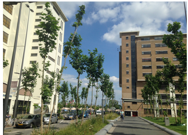
Fig. 4 Strijp S: Torenallee, the green avenue.

With concern to the industrial heritage, located in the “Triangle” area, the general design principle focuses on the transformation of the plinths and the roofs of the existing buildings [19]. Both parts will accommodate public functions, while the main body will host lofts and offices of a private character.