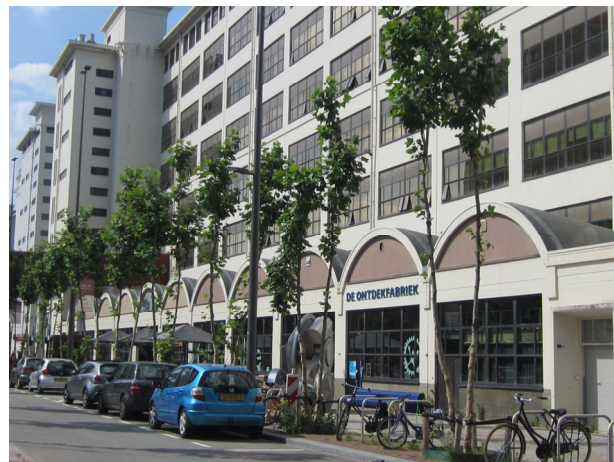
Fig. 5 Strijp S: the Ontdekkabriek in the High Spine.

The 550 m long roof of pipelines and ducts, named Leidingstraat is kept as a historical artefact and is an important carrier of the identity of the site [14]. It provides access to the first floors of several buildings. It is an open “catwalk” that connects singular areas for creativity: the High Line Project in New York City is the evident reminder. Aesthetically, this “industrial pergola” is a comfortable green terrace with an original lighting design (by Piet Oudolf, landscape architect). Artistic and temporary interventions show here to what extent is possible to stretch opportunities