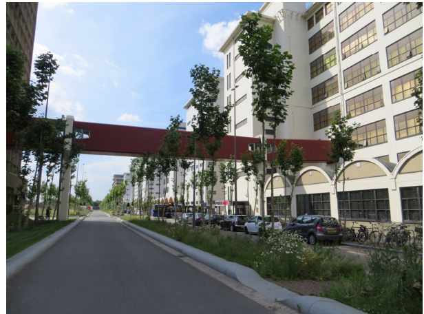
Fig. 7 Strijp S: the Hoge Rug, the High Spine.

• New architecture: Consistently with the principle of “contrast”, the new architecture proposes contrasting materials and higher volumes to the existing one.