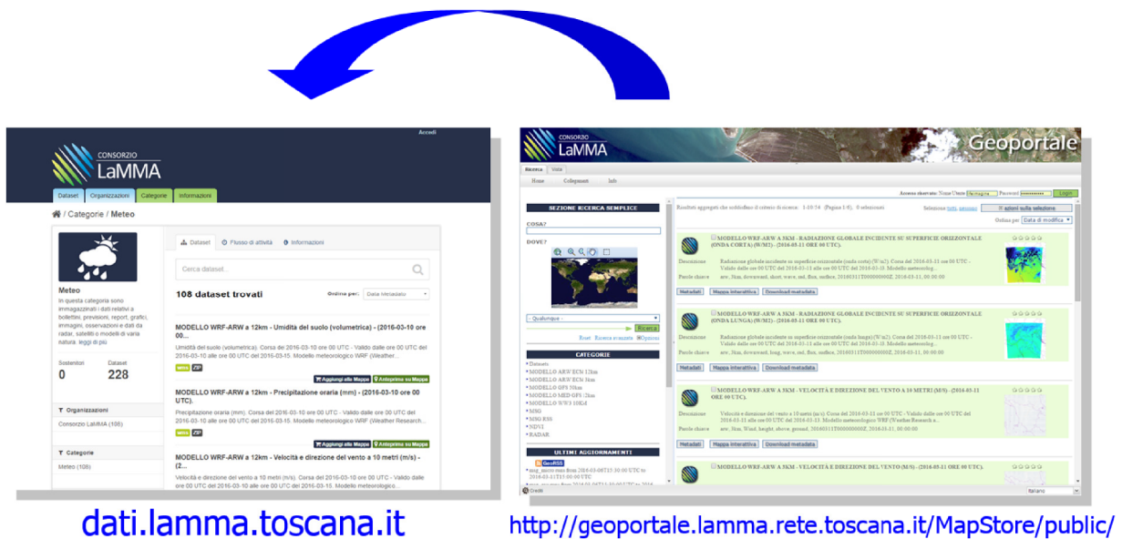
Figure 3: the interconnection between geoportal and open data platform through the metadata catalogue

The open data platform is directly connected to the Geonetwork metadata catalogue that in turn automatically provide a real-time ingestion of datasets in geoportal. For that, each metadata must include resources for download when already available on geoportal as well as open data platform, such as WMS and WMTS for time and elevation weather parameters. The Lamma open data infrastructure has been implemented by the use of CKAN software, which is the world's leading platform for portals of open-source data, developed by the Open Knowledge Foundation, a no profit organization that promotes free knowledge. All the datasets have been made available according to the CC-BY license - Attribution Creative Commons.