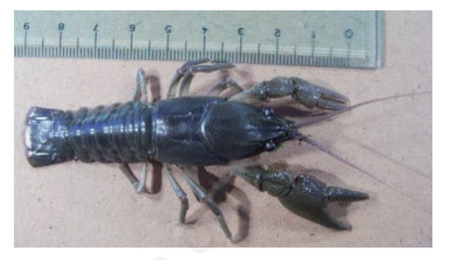
Fig. 2. An individual of Austropotamobius italicus meridionalis from the study site in Sardinia.