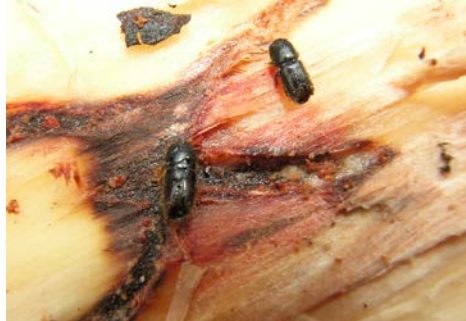
Fig. 3. Ips sexdentatus galleries under pine bark. The dark color is given by the infection of Leptographium sp., which can be transported by the bark beetle.

surface of infected cones; these conidia, adhering to body setae of L. occidentalis , may be vehiculated on other plants (MANCINI et al. , 2010).