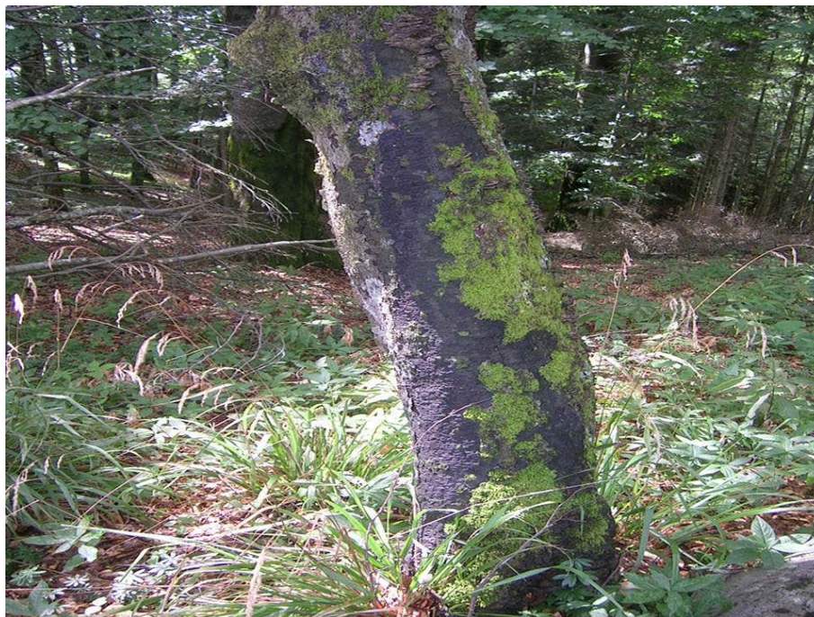
Fig. 5. Large stromata of Biscogniauxia mediterranea , agent of charcoal canker on oaks. The perithecia are immersed in the inner layer of stromata, in contact with the woody tissue; at maturity they release the ascospores which can contaminate potential insect vectors.

The following species display such a behavior on oaks: Biscogniauxia mediterranea (De Not.) Kuntze (Fig. 5), Botryosphaeria dothidea (Moug.) Ces. & De Not. (Fig. 6), Diplodia seriata De Not., Phoma cava Schulzer, Neofusicoccum parvum (Pennycook & Samuels) Crous, Slippers & A.J.L. Phillips. These endophytic pathogens, similarly to D. mutila and P. quercina , may be transported by the above insect vectors, or by other bark beetles occurring on the same oak trees (RAGAZZI, 2004; TIBERI and ROVERSI, 2004).