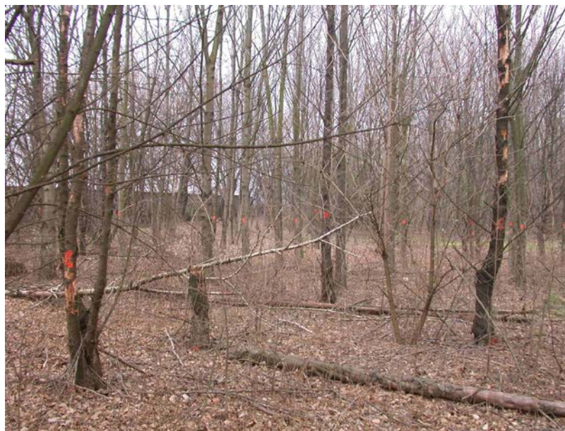
Fig. 6. Longitudinal lesions caused by Botryosphaeria dothidea on the stem of many Acer pseudoplatanus trees. Deep bark cracks induce tree death.

Fig. 6. Lesioni longitudinali provocate da Botryosphaeria dothidea sul fusto di numerose piante di Acer pseudoplatanus . Profonde lacerazioni del tessuto corticale portano a morte le piante.